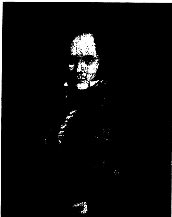
GENERAL SIR W. H. SLEEMAN, K.C.B.