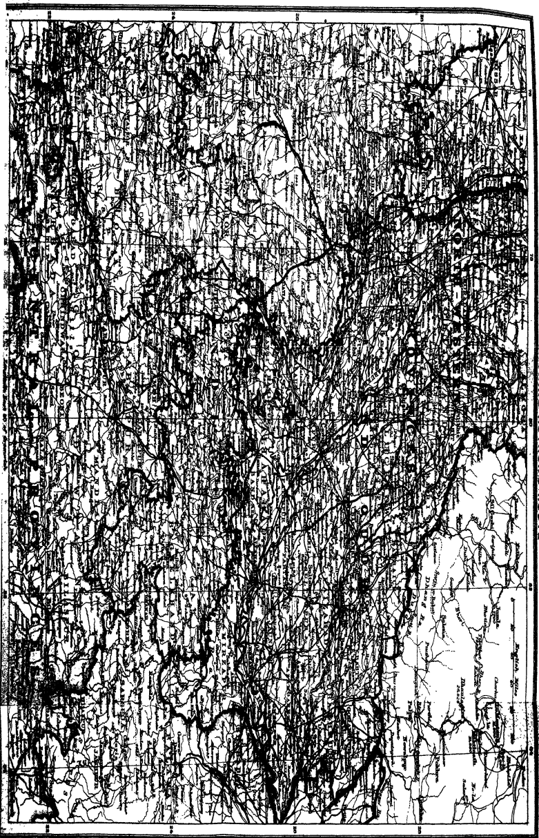
MAP SHOWING AUTHOR'S ROUTE