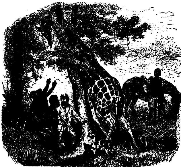
Specimen of the Illustrations.