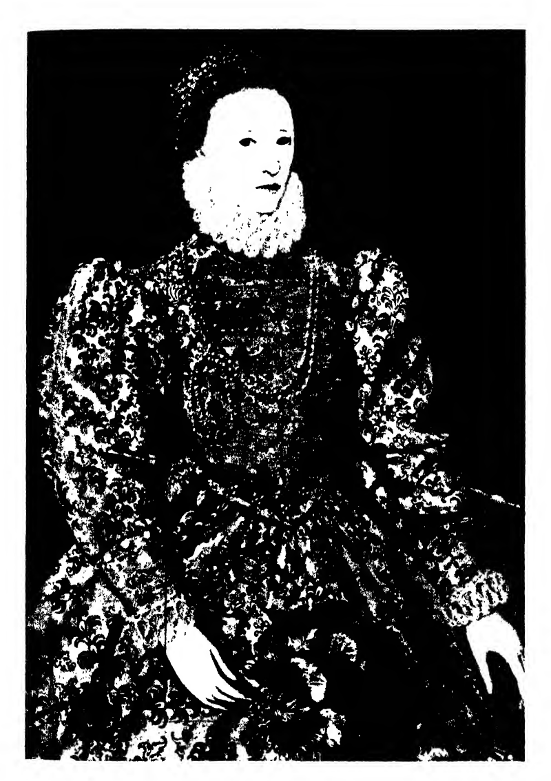
QUEEN ELIZABETH From the National Portrait Gallery. Painter unknown.