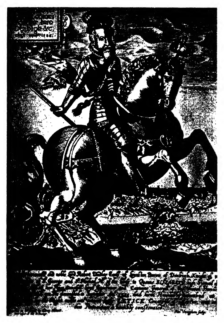
LEICESTER IN THE NETHERLANDS A posthumous Engraving by R. Vaughan dedicated to Leicester's Widow.