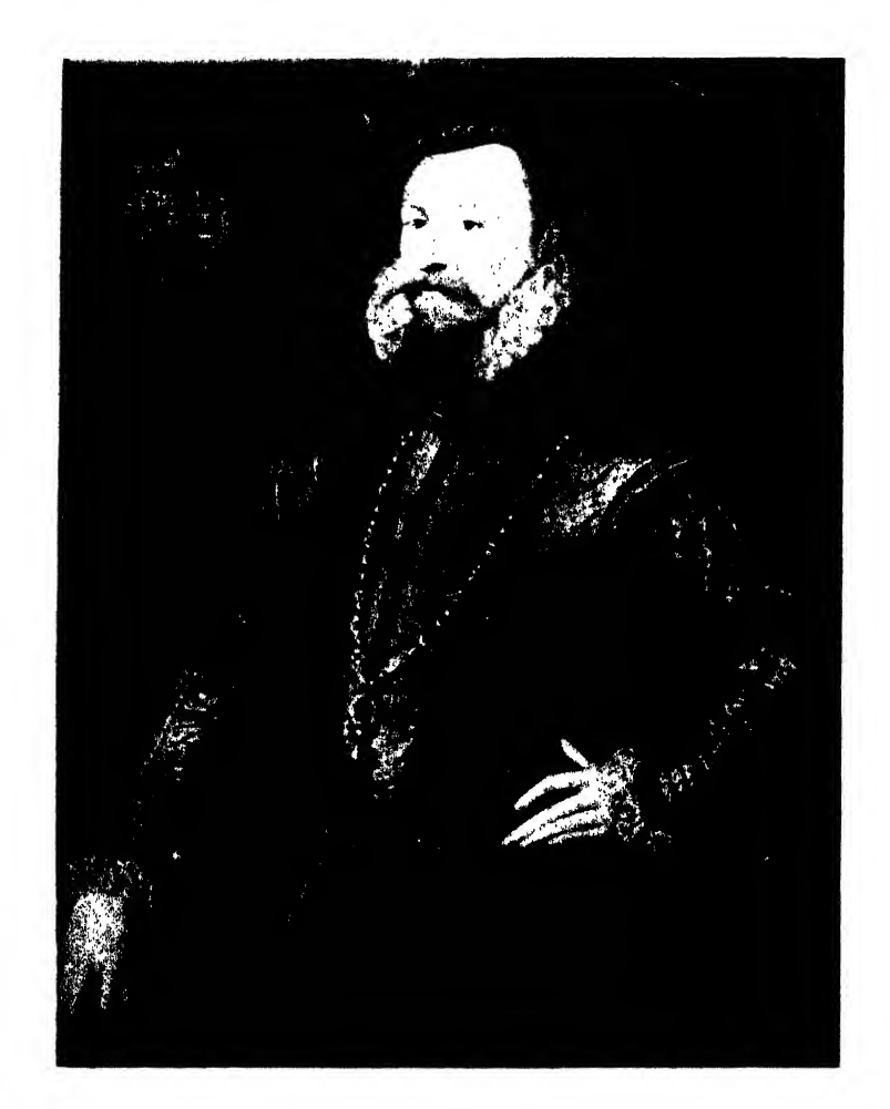
ROBERT DUDLEY, EARL OF LEICESTER Painter unknown.