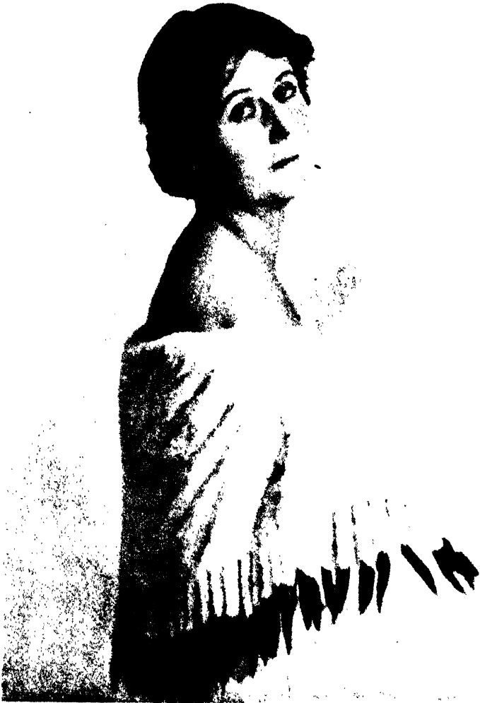
ISADORA DUNCAN, FROM A PHOTOGRAPH TAKEN ABOUT 1915 (She is wearing the ermine coat which she sold later to an American singer)