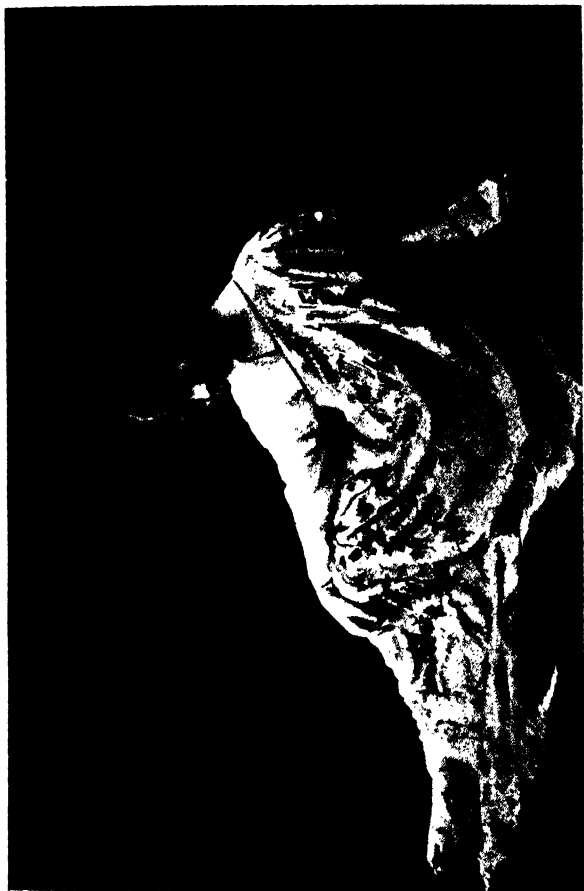
ISADORA DUNCAN IN ONE OF HER BEAUTIFUL SPANISH SHAWLS (1912)