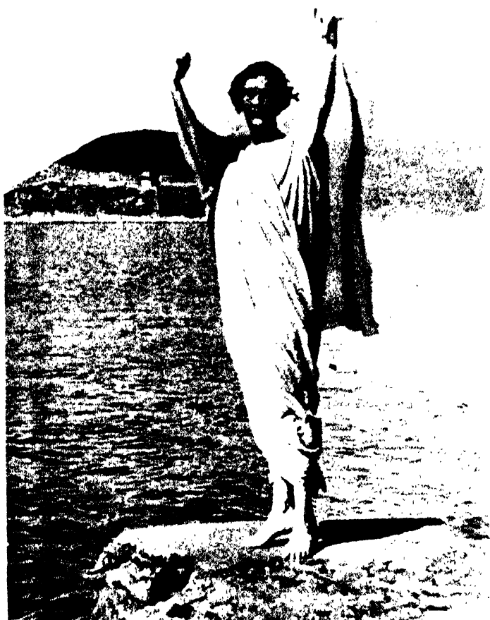
ISADORA DUNCAN AT CAP FERIAT (1916)