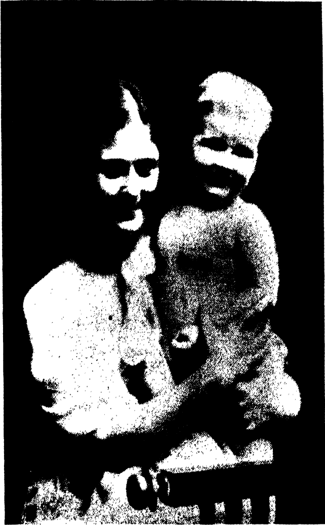
ISADORA DUNCAN WITH HER DAUGHTER DEIRDRE, PARIS (1911)