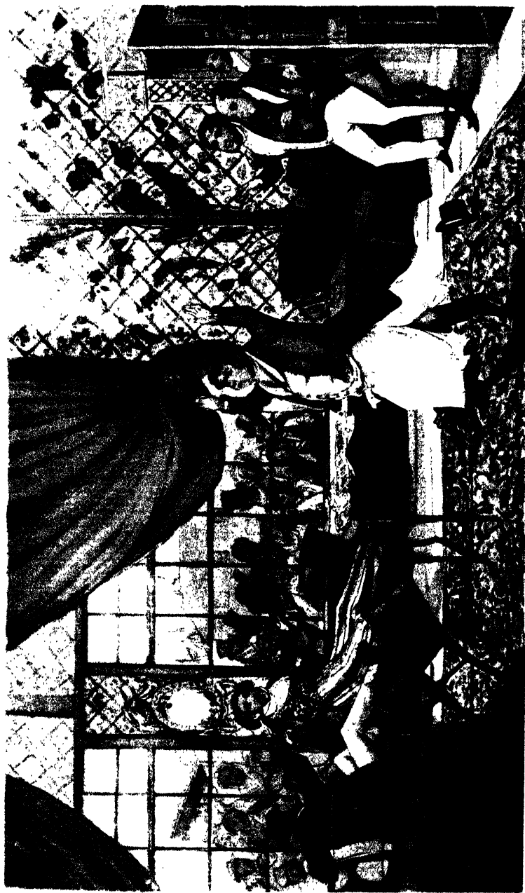
"OH GENTLEMEN! GENTLEMEN! HERE'S A LAMENTABLE OCCURRENCE."