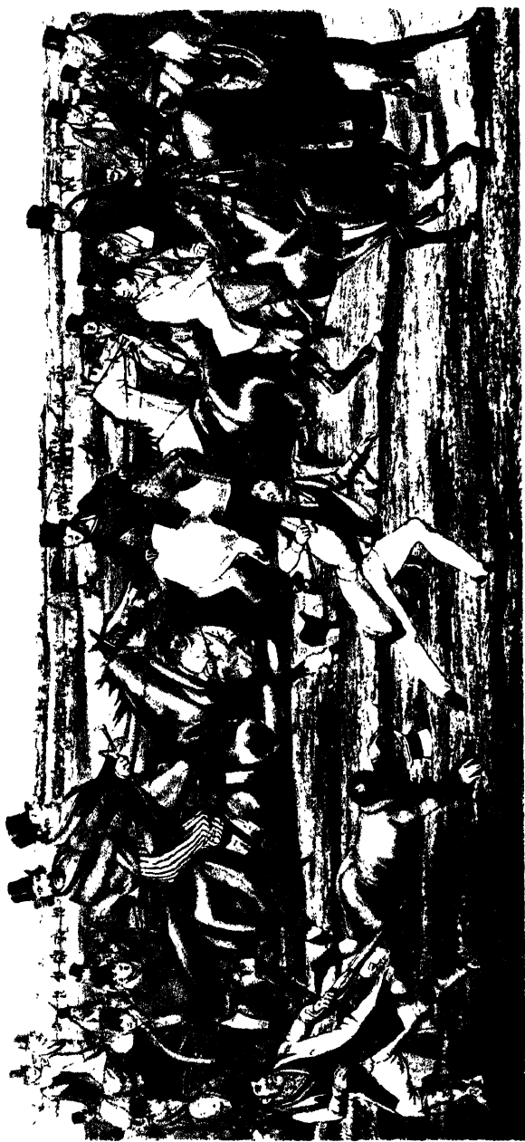
MR. JORROCKS MAKES HIS ENTREE INTO THE NEWMARKET BETTING RING.