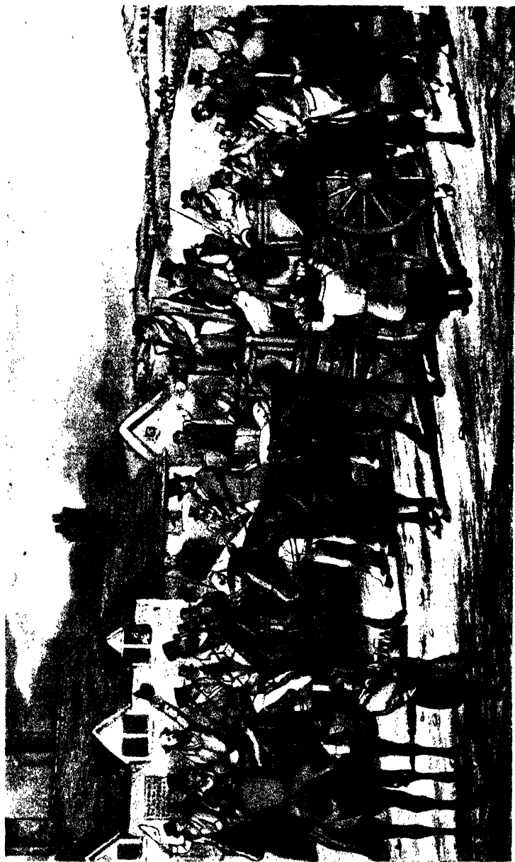
MR. JORROCKS DECLARES HIS INABILITY TO SUBSCRIBE TO THE SURREY STAG HOUNDS.