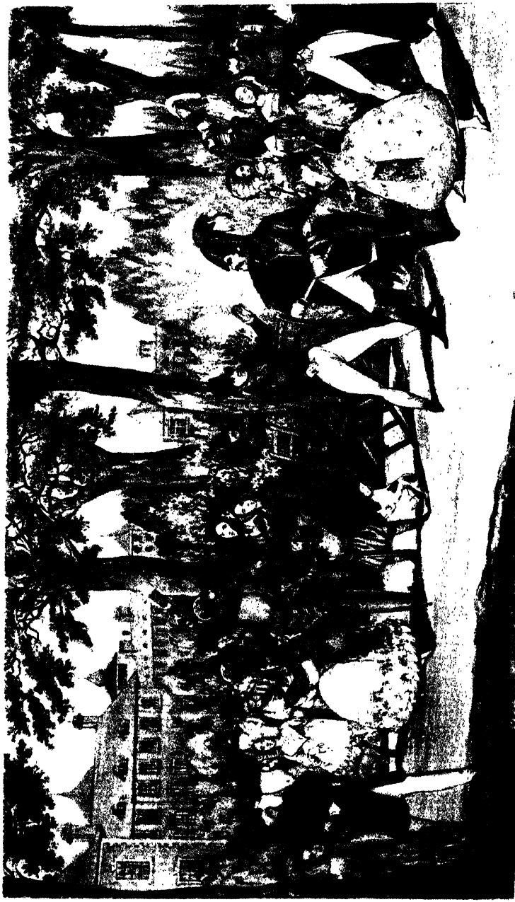
M. JORROCKS RENOUNCES THE ACQUAINTANCE OF THE YORKSHIREMAN.