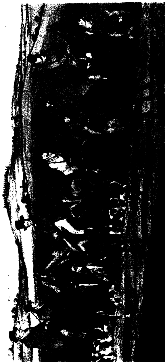
THE APPEARANCE OF SWELL ASTONISHES THE SURREY HUNT.