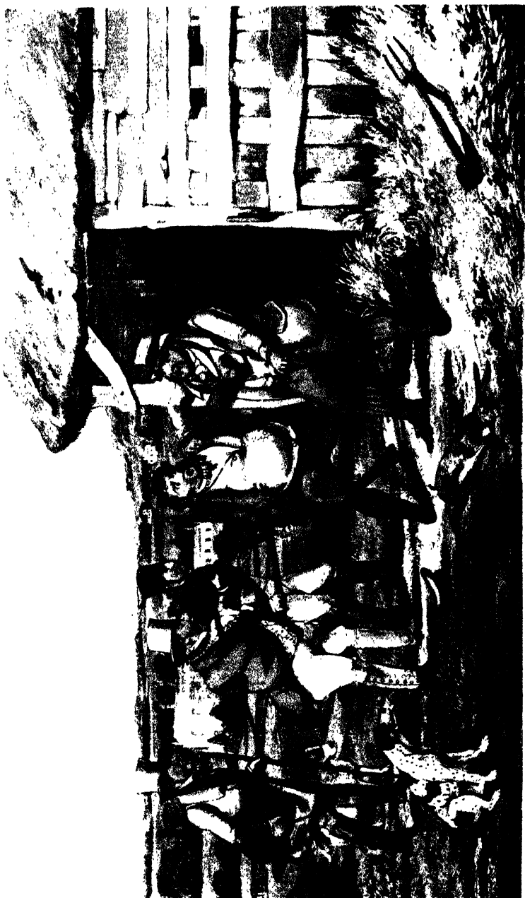
SQUIRE CHEATUM'S KEEPER ATTACKS THE MURDERER OF OLD TOM.