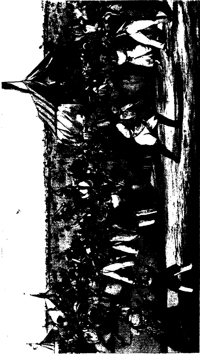
MR. JORROCKS BEATS THE BARON FOR SPEED.