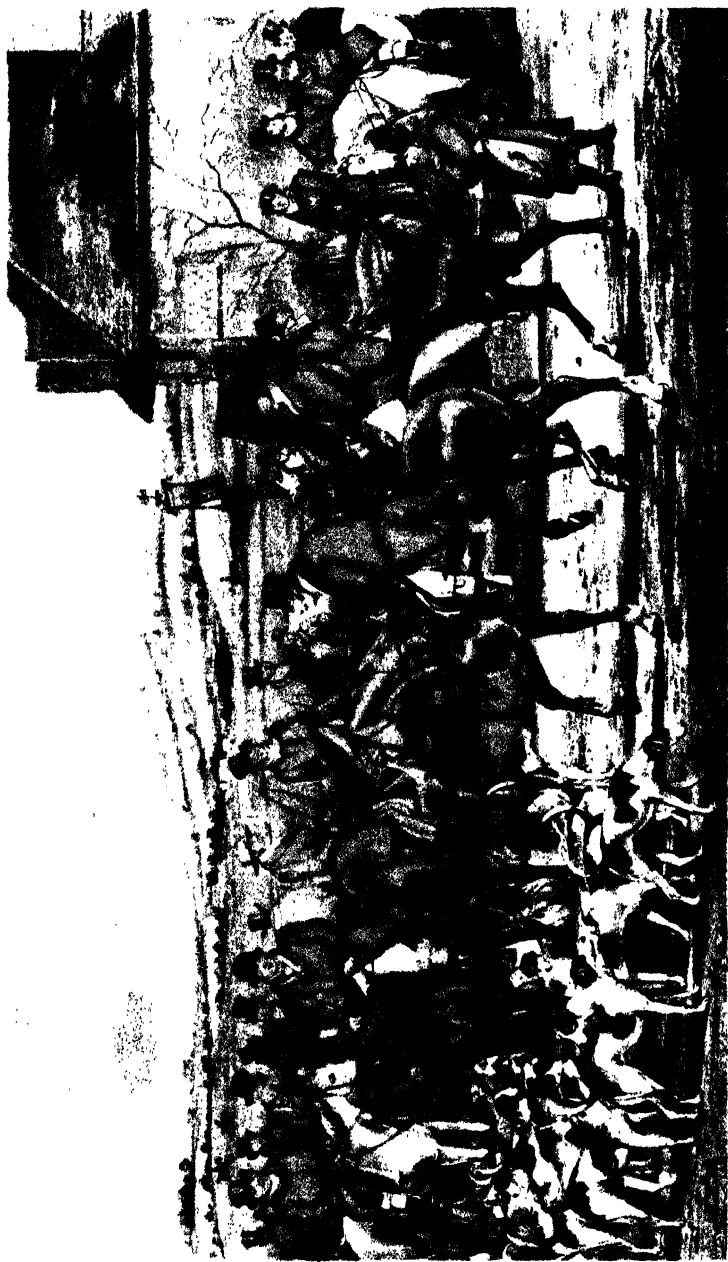
MR. JORROCKS INTRODUCES THE YORKSHIREMAN TO THE SURREY.