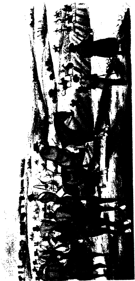
M r JORROCKS "TELEGRAPHS" THE FOX.