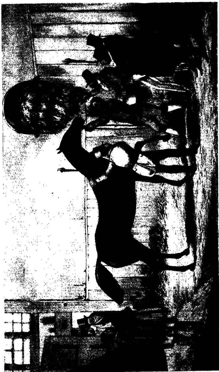
THE BARON "VILLS HIS WET."