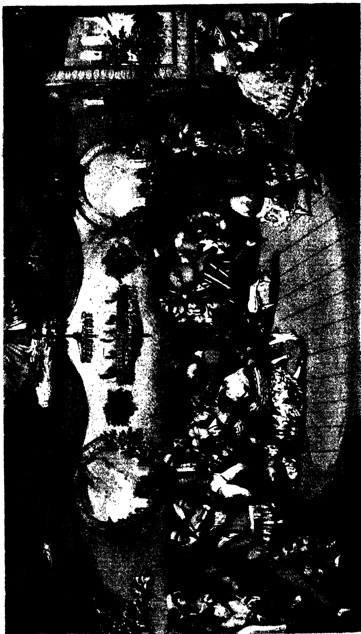
MR. JORROCKS MAKES A FAUX PAS.