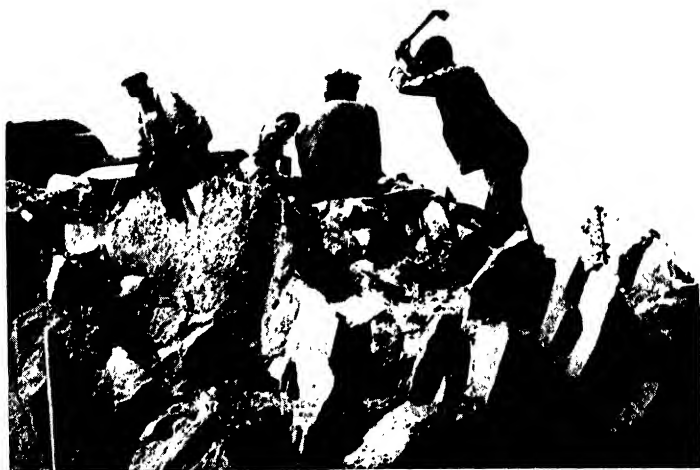
THE PRISONERS AT WORK