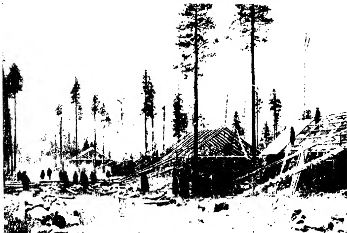
BARRACKS FOR THE PRISONERS WORKING ON THE BALTIC-WHITE SEA CANAL