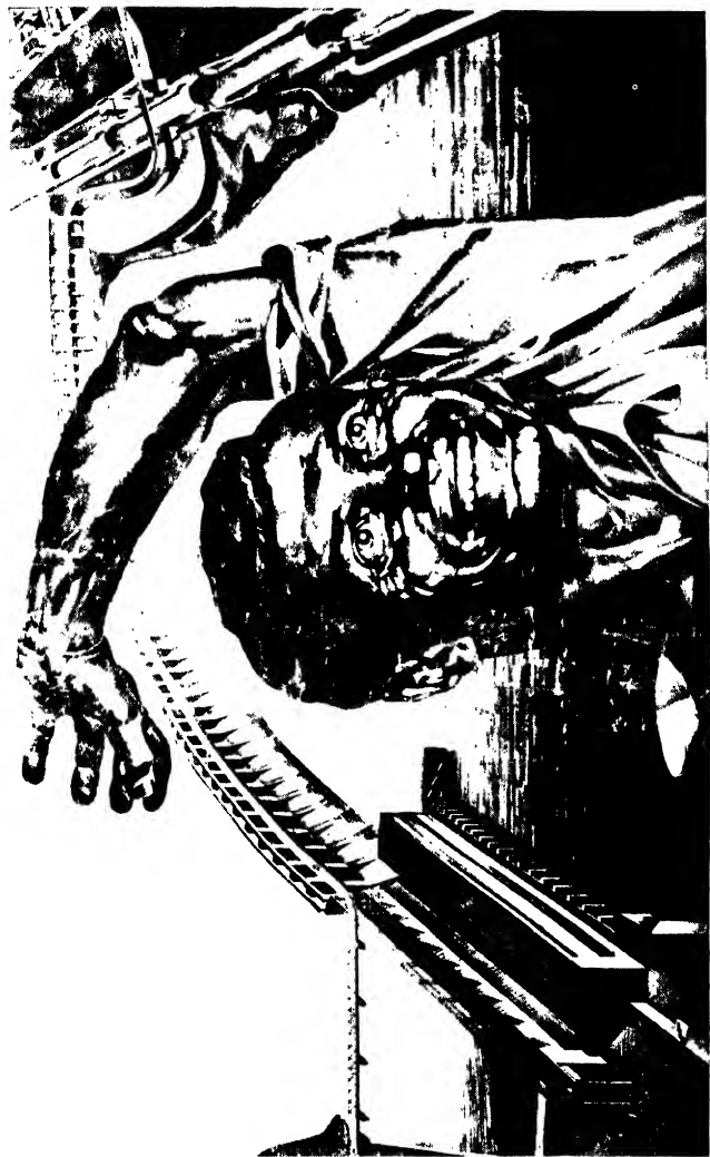
A SOVIET POSTER CELEBRATING THE COMPLETION OF THE DNIEPER DAM