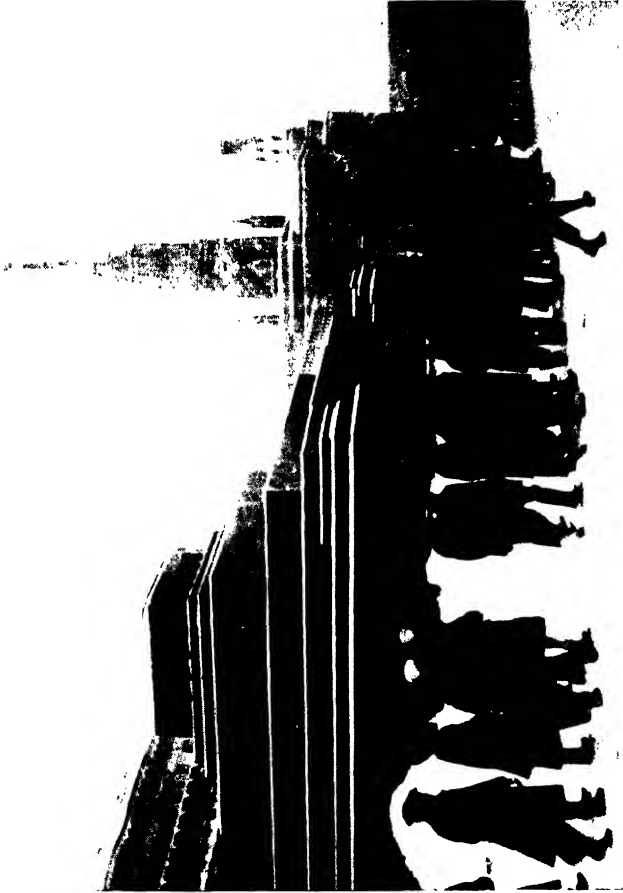
CITIZENS IN LINE TO VISIT LENIN'S TOMB