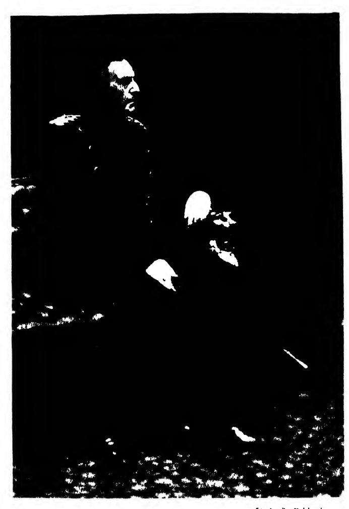
[Scherl's Bilder herst