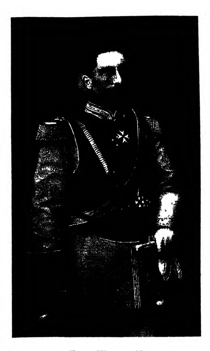
KAISER WILHELM II