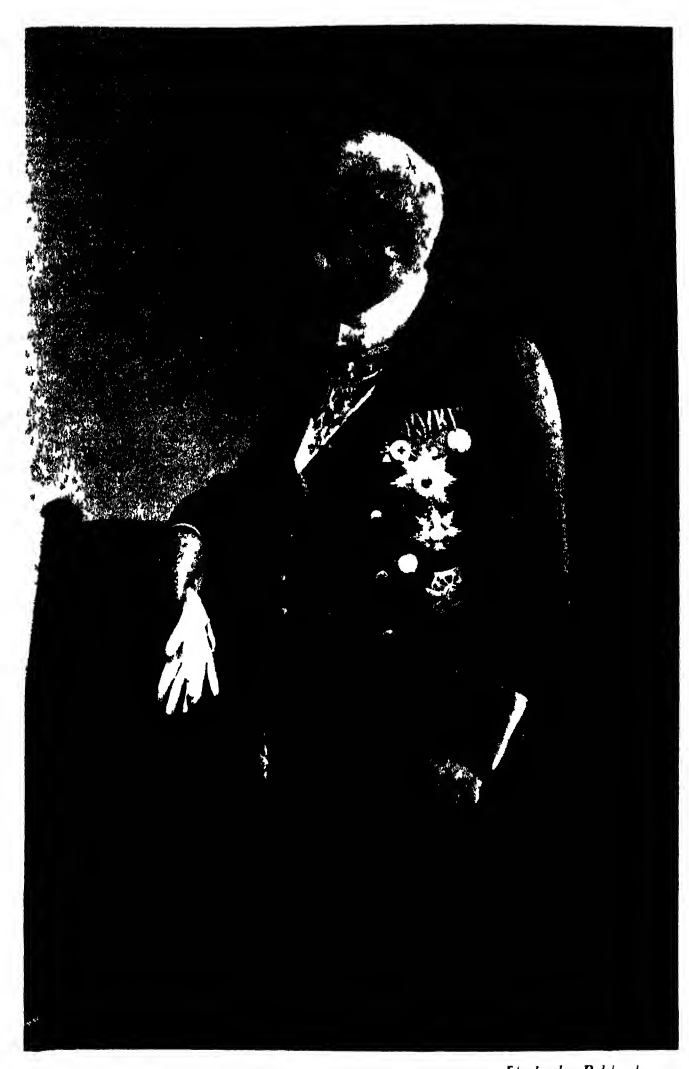
[Schols Bilter ton t