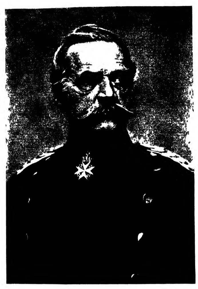
[Scherl's Bilter tienst