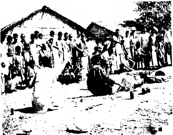
Top: Rural scene, with primitive spinning wheel, or charka. Bottom: Itinerant hypnotist and magician (see p. 18).