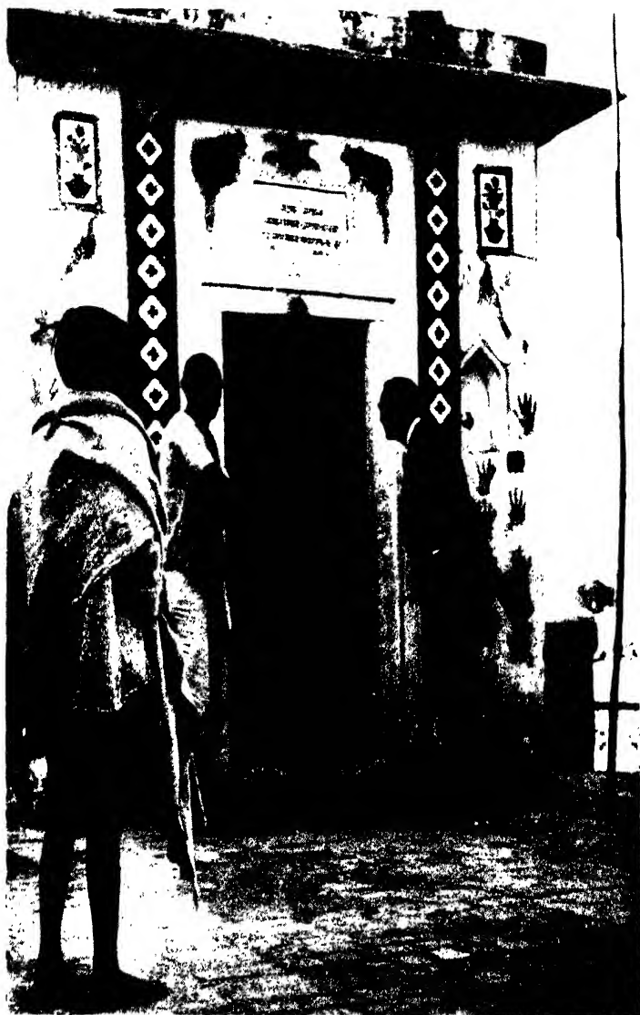
Village Shiva Temple (see p. 126)