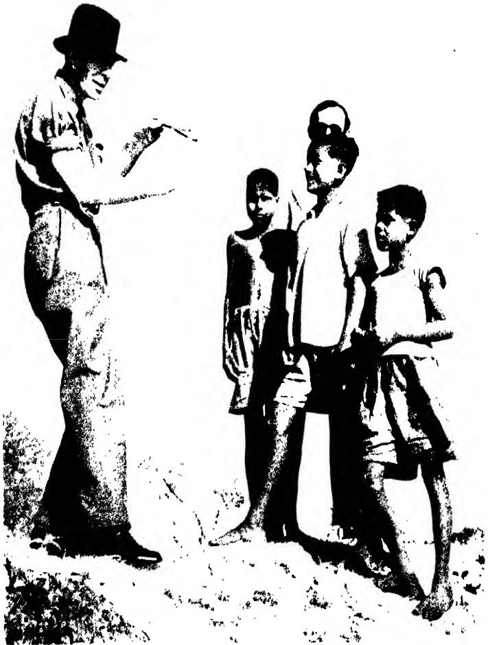
Dubious European example to young India!