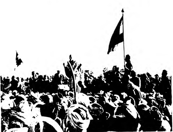
Top: Flashlight of Khan Abdul Gaffar Khan and son.