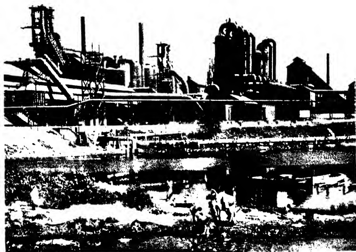
Top - Abandoned town at Jaipur, with "my" elephant! Bottom - Corner of Late Steel Works, Jaipur (page 47)