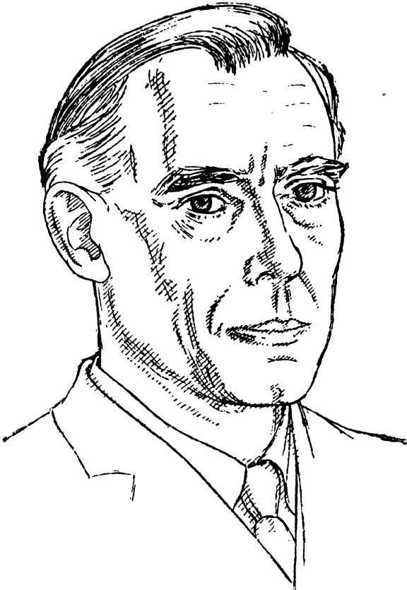
Sketch by Moira Sorensen