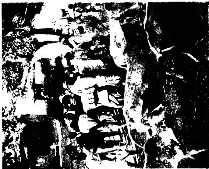
A talk with a villager.