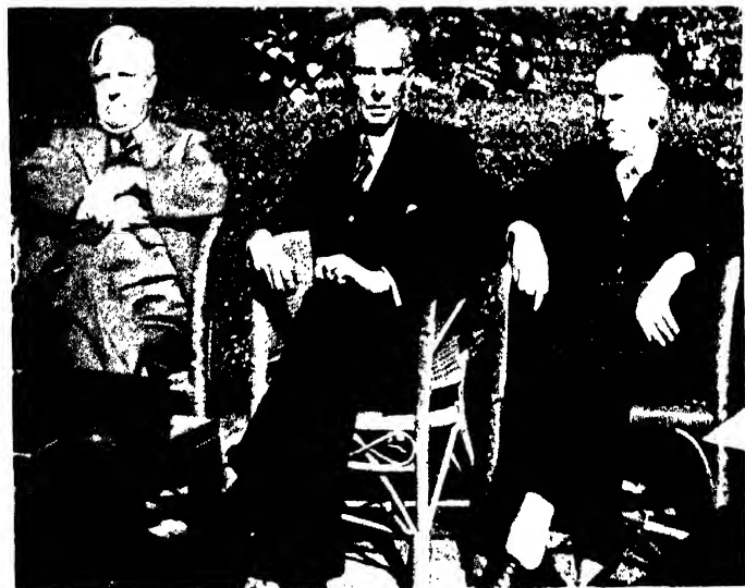
Top: A chat with Pandit Nehru.