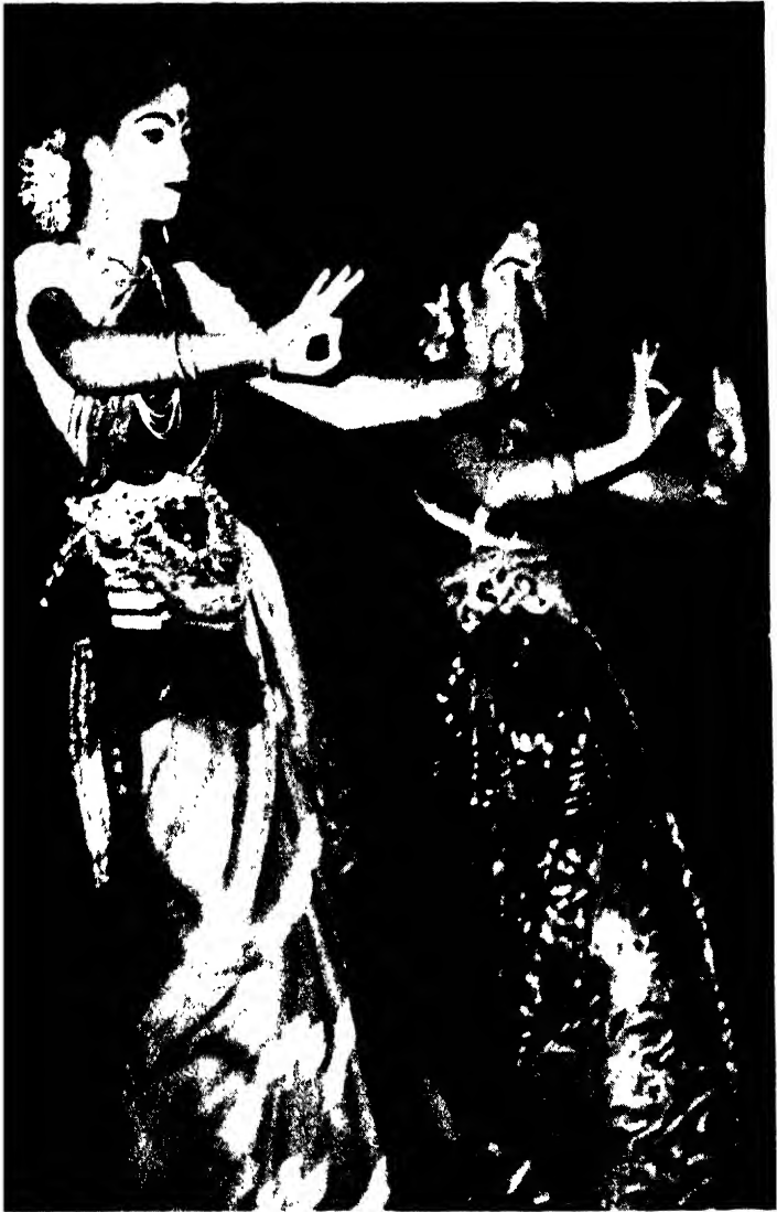
Women dancers (see p. 130).