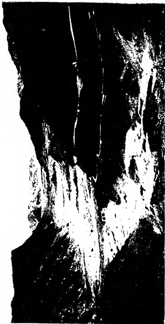
Afghanistan, vista from Khiber Pass, N.W. Frontier