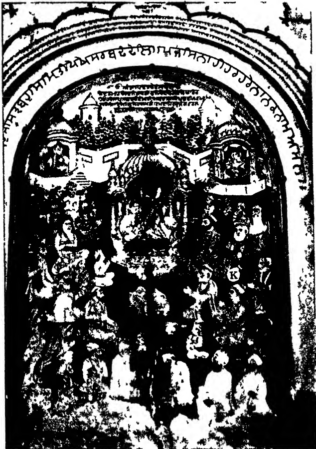
GURU ARJAN DEV . . . Centre KABIR . . . K