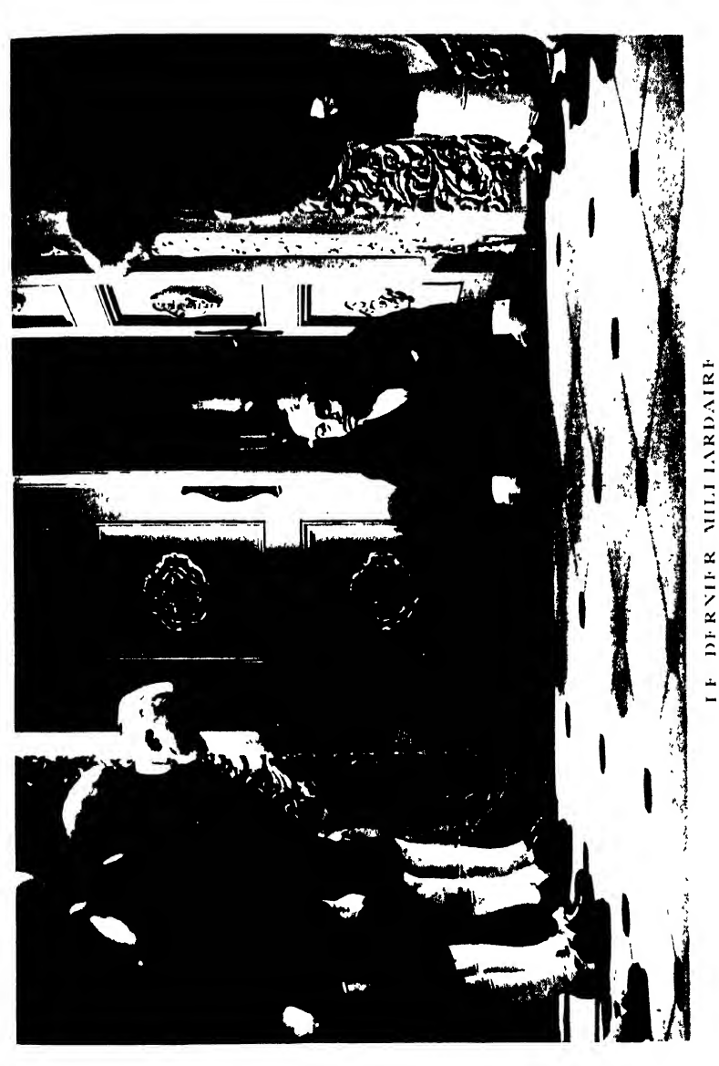
Banco Max Dearly, self-declared dietator of Casinano, whose mind was touched at the commence-ment of his rule by a blow on the head, forces the ministers to wear shorts and back good-night to him