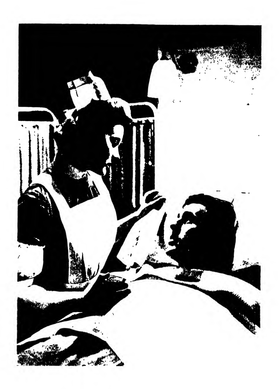
STEWART GRANGER AND ROSAMOND JOHN IN THE LAMP STILL BURNS. An 'A' film which ought to have been certified as a 'U' film