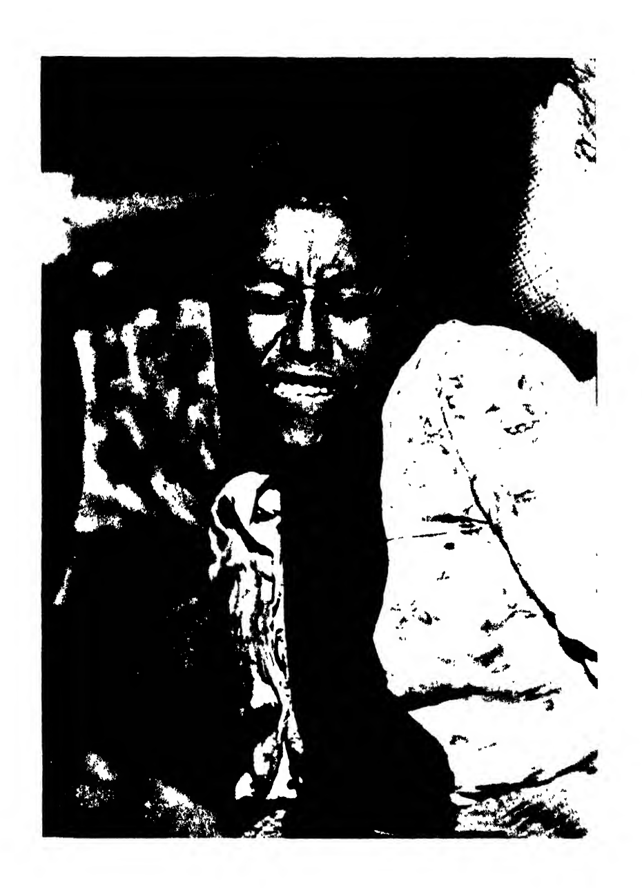
WOMAN IN LABOUR FROM TORGOTTEN VILLAGE A great film which was not passed by the British Board of Film Censors for adult film-goers