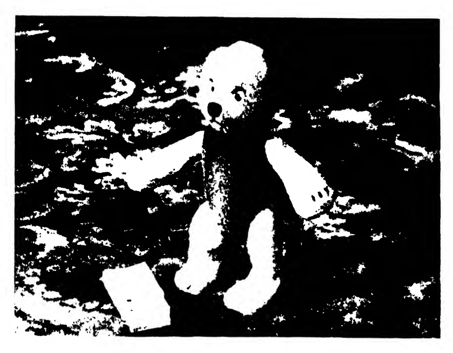
FROM THE RUSSIAN FILM 'LAND OF TOYS'