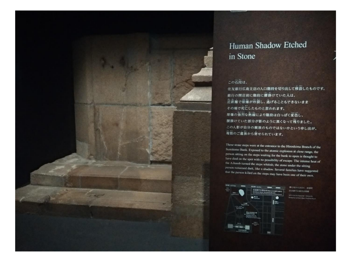
Figure 8: Display inside the Peace Memorial Museum, Hiroshima. Date: 18<sup>th</sup> August 2019.

Figure 8 from the Peace Memorial Museum, assimilates time, history, memory and experience. The stone slab exhibited in the museum and the museum itself encapsulates space at one particular time. The display titled "Human Shadow Etched in Stone", as seen in the image, reads: