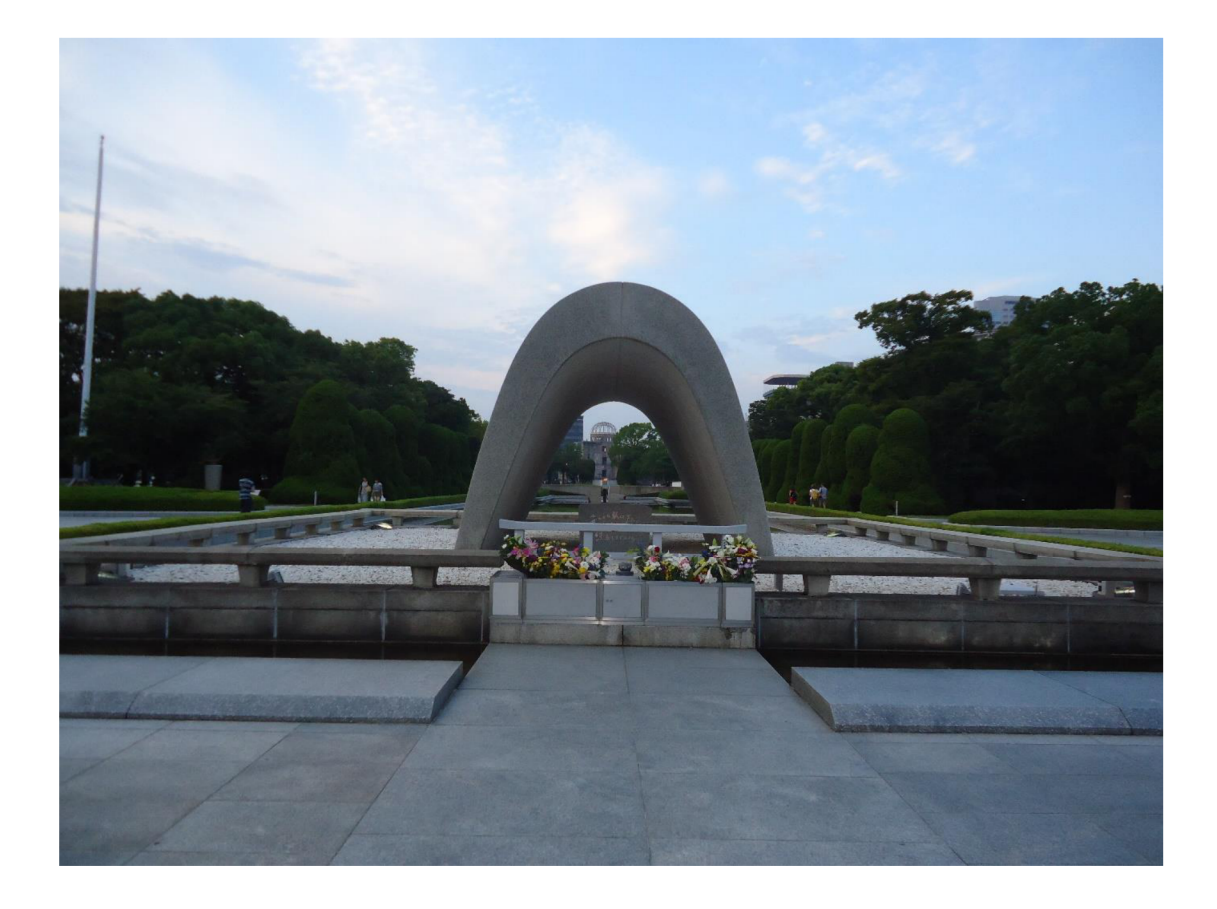
Figure 7: The Peace Memorial near the Hiroshima Atomic Bomb Site. In this picture the Genbaku dome is visible through the centre of the curvature of the memorial.

The images above (Figure 5 and Figure 6) indicate that spaces and memories are deeply interwoven with time. The Genbaku Dome is preserved, and thereby in a frozen in time, in the post-bombing state of destruction. The visuality of the Dome is jarring as its stands among the surrounding redeveloped areas. The decision to leave the Dome as it is, without restoring it to the earlier state, renders the dome to be a historic symbol of the dangers of nuclear warfare. James too recollects the "mushroom cloud" in Devices and Desires (1989) (593–594). With the entitlement of a World Heritage Site, the Dome attracts tourists who visit the site and the Peace Memorial and Museum (Figure 7 and Figure 8).