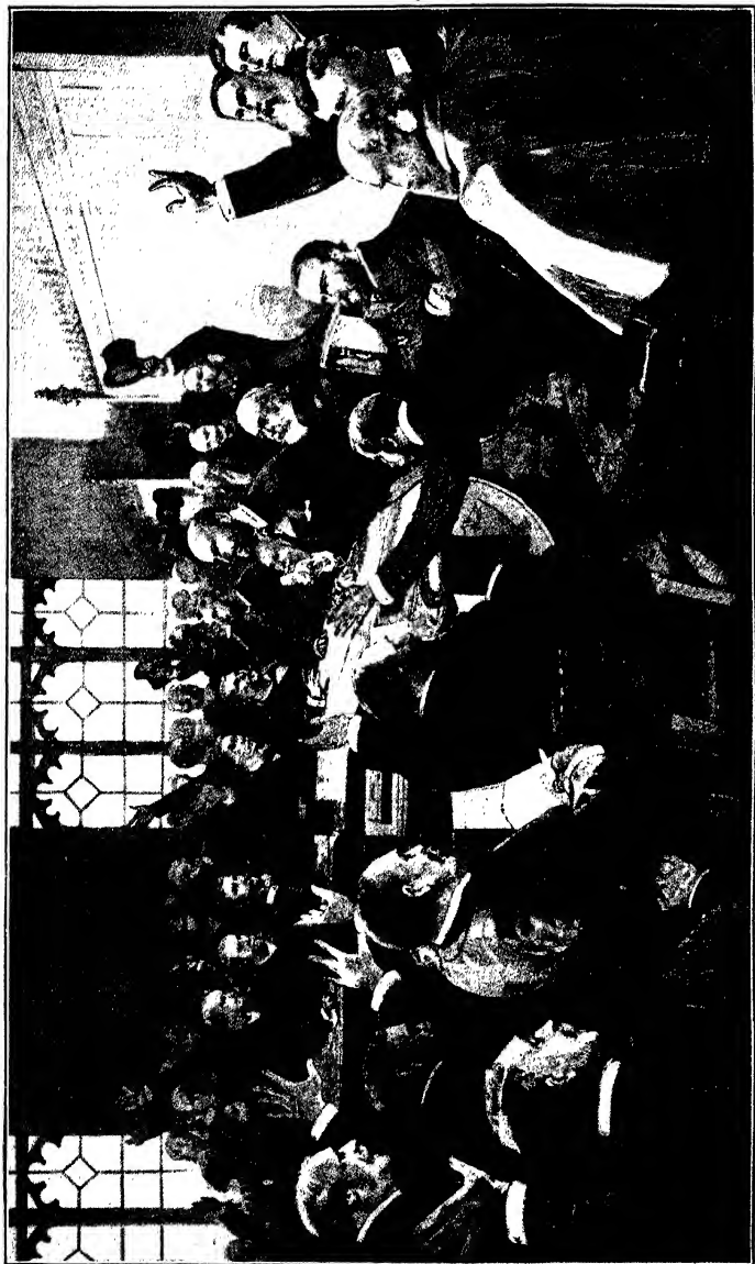
Re-election of Mr. Parnell as Leader of the Irish Party in Committee Room No. 15, House of Commons, on 25th November 1890