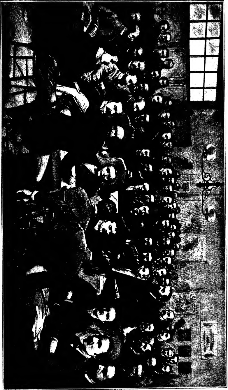
The Irish Parliamentary Party, April 1886