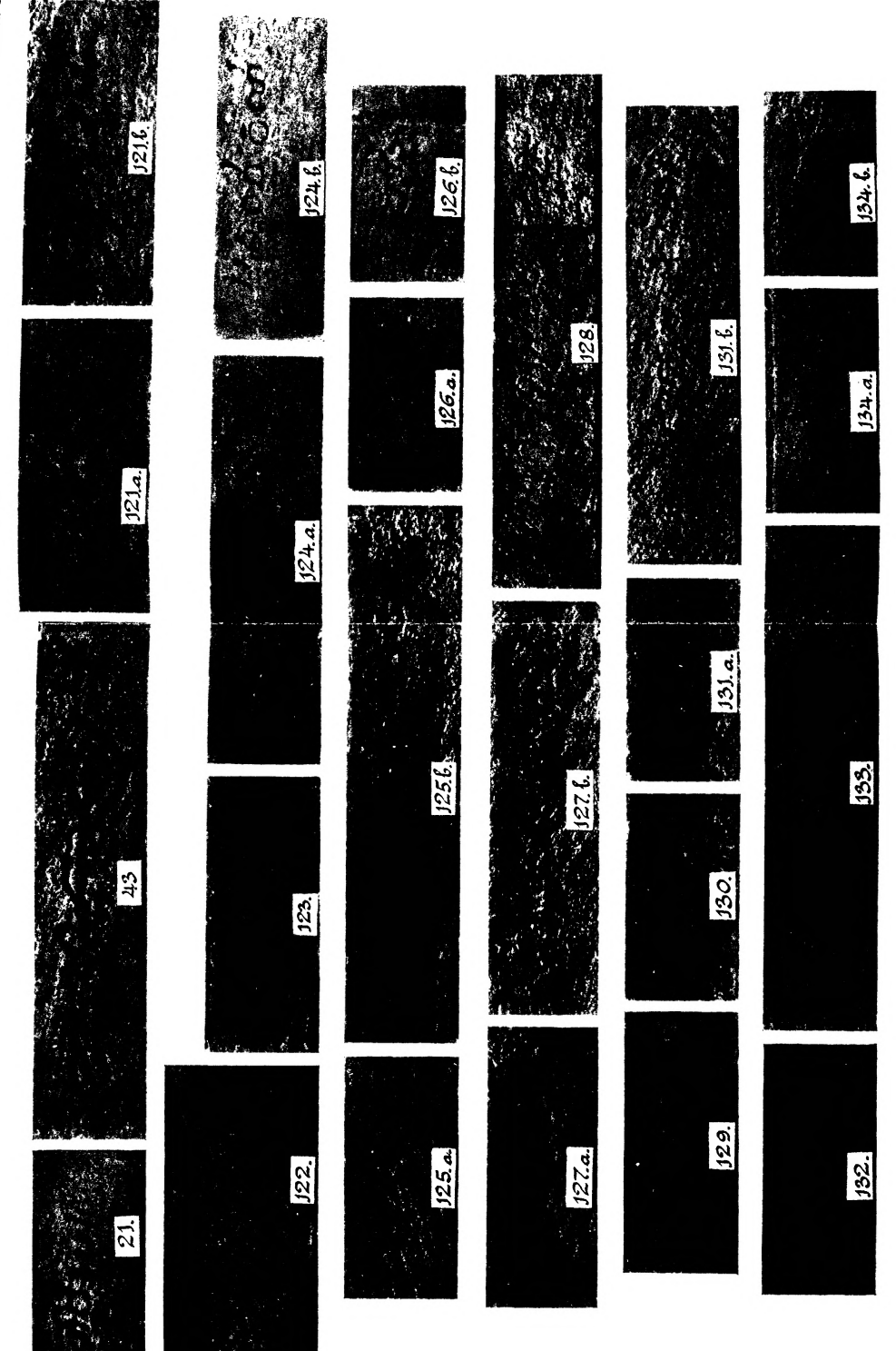
INSCRIPTIONS ON INNER-BASEMENT