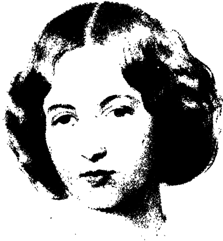
EFFIE GRAY BY G. F. WATTS