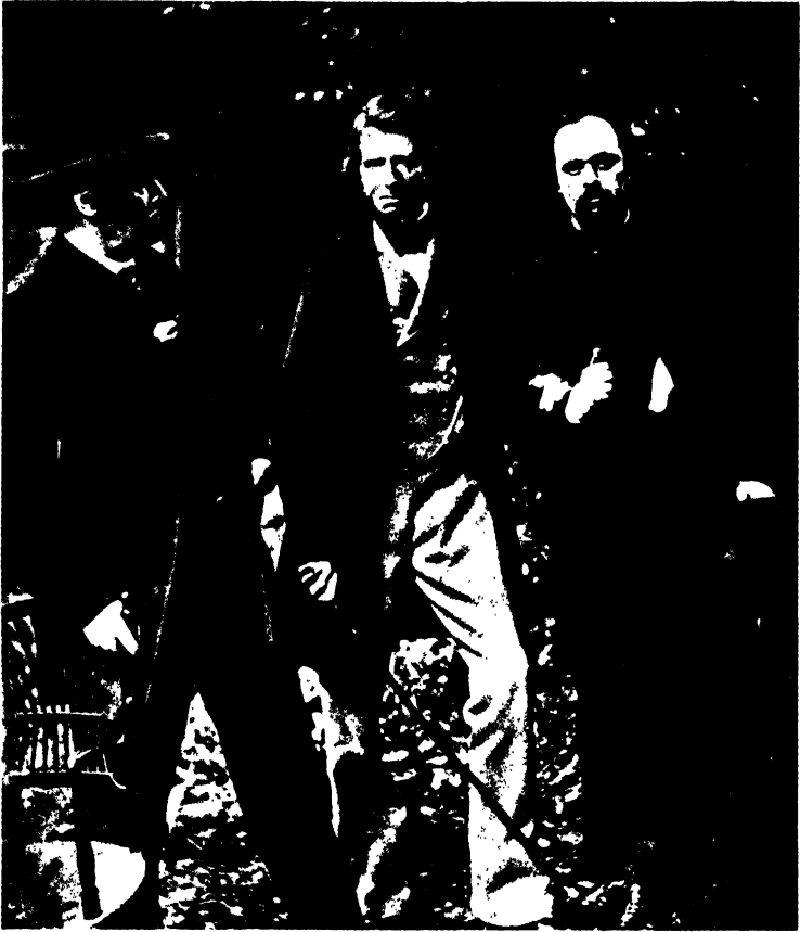
WILLIAM BELL SCOTT, RUSKIN AND ROSSETTI IN 1863