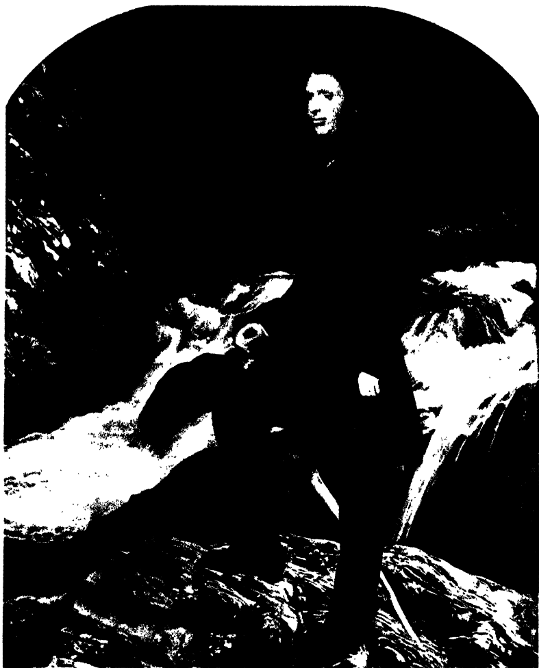
JOHN RUSKIN BY SIR J. E. MILLAIS, P.R.A., 1853-54