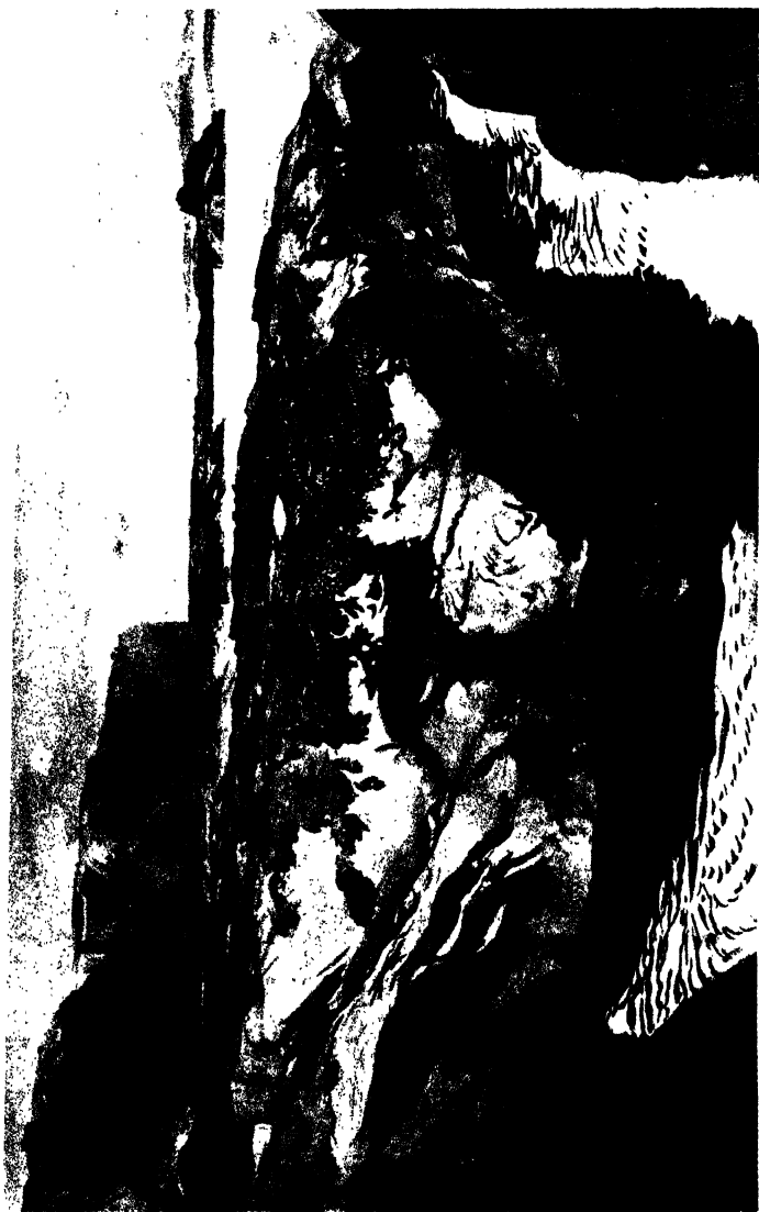
COAST SCENE NEAR DUNBAR BY JOHN RUSKIN, 1857