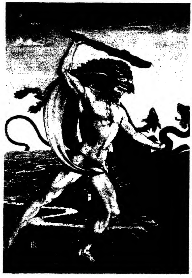
ANTONIO POLLAIUOLO. HERCULES AND THE HYDRA Umbi Gallery, Florence