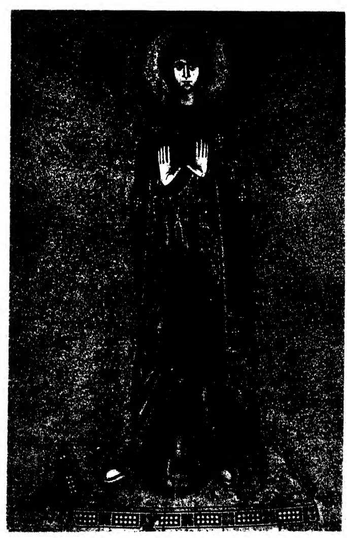
MADONNA Mosaic, Murano Cathedral