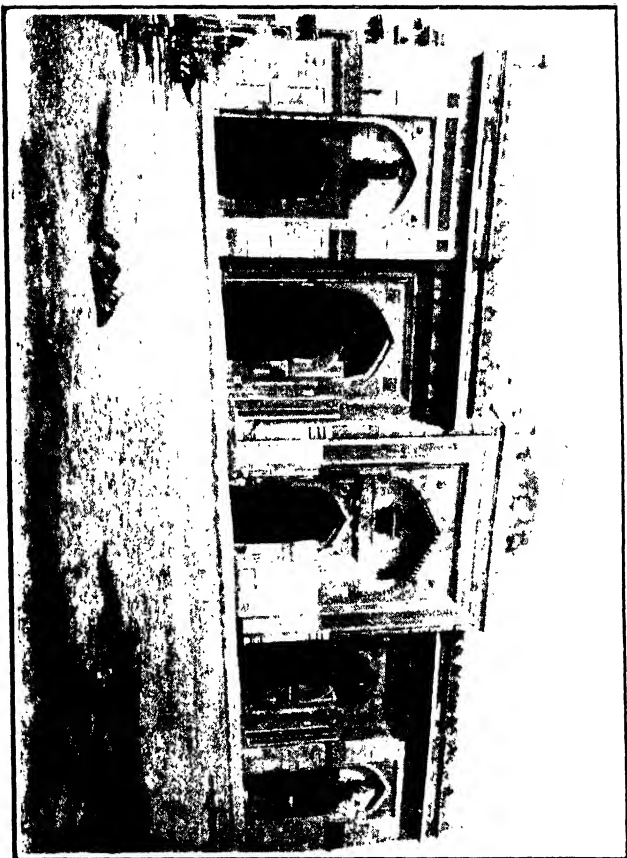
MOSQUE OF SHER SHAH IDERPURI, DELHI PURANA QILA.