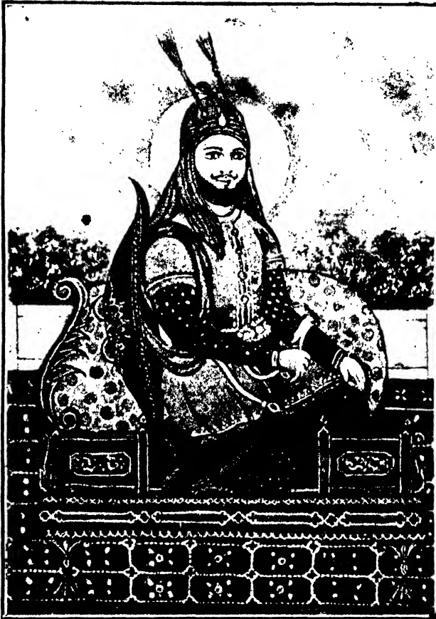
SHER SHAH AFGHAN.