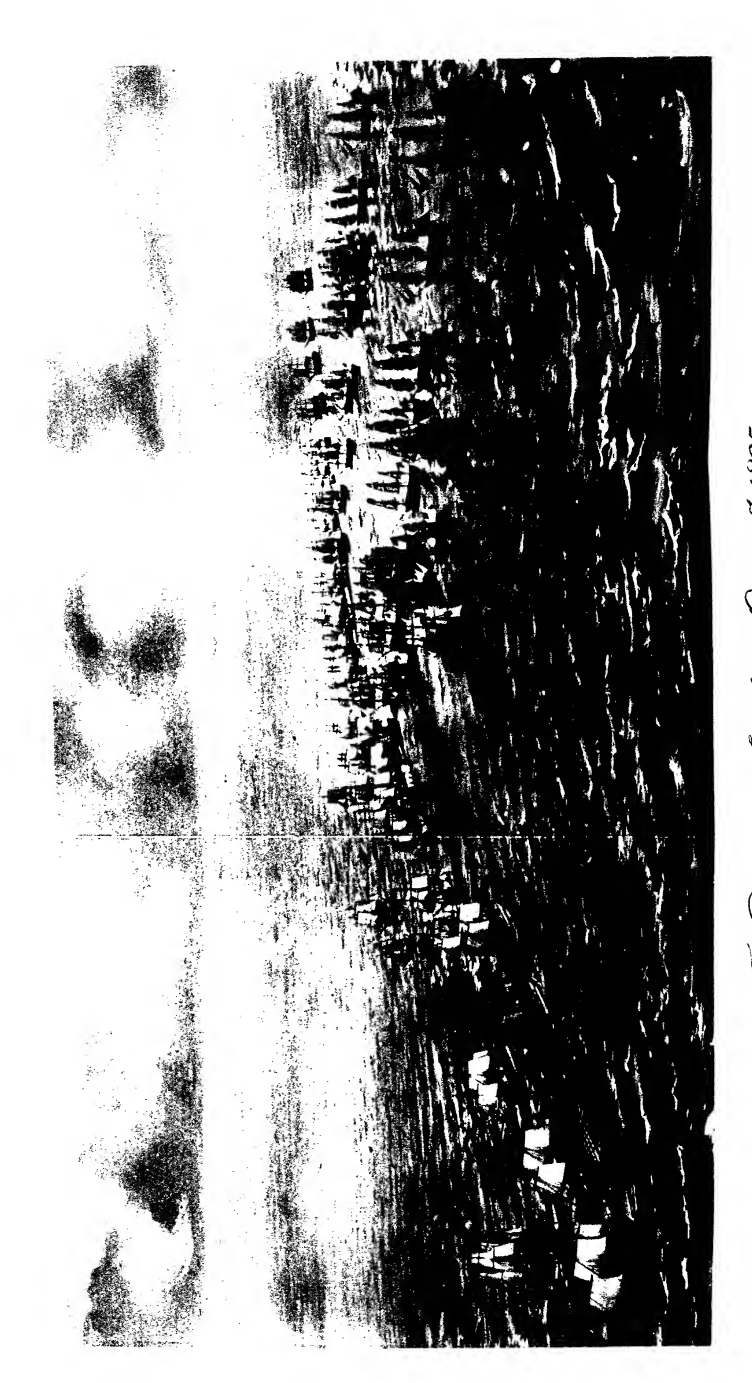
The Battle of Frafalgar, Oct. 21st 1805. From the Modelin the United Service Institution. By hind permission