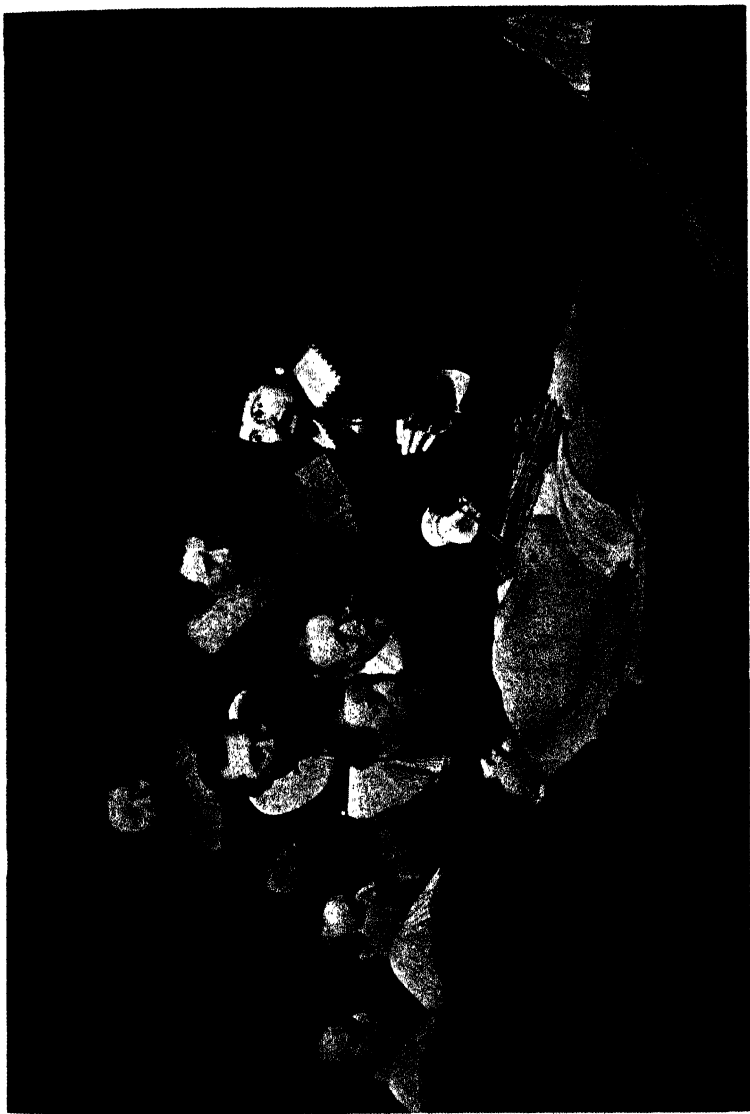
THE ANATOMY LESSON OF DR. NIKOLAAS TULP