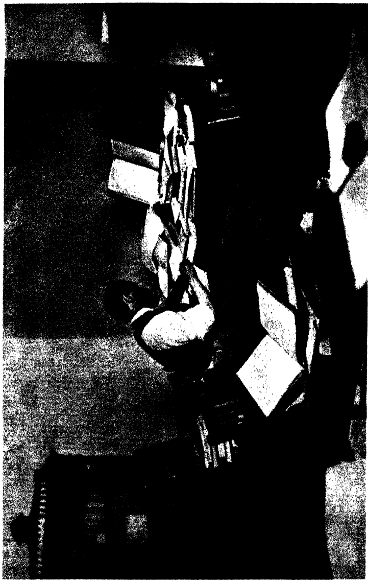
WILLIAM OSLER : PARTURIT OSLER NASCITUR LIBER