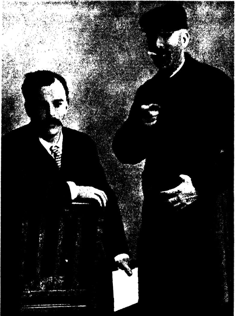
HUGH OWEN THOMAS AND ROBERT JONES circa 1885