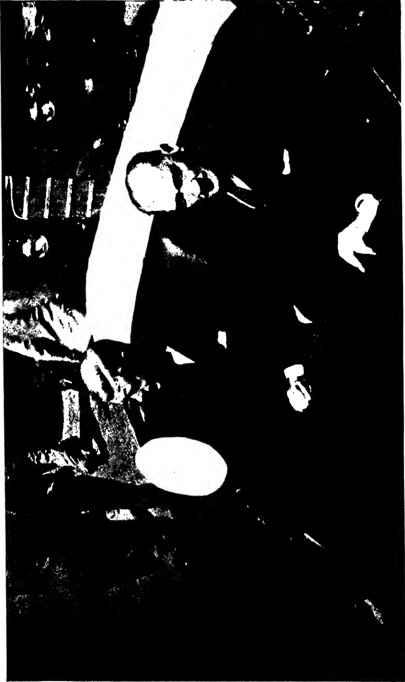
EDWARD VIII AND KAMAL ATATURK