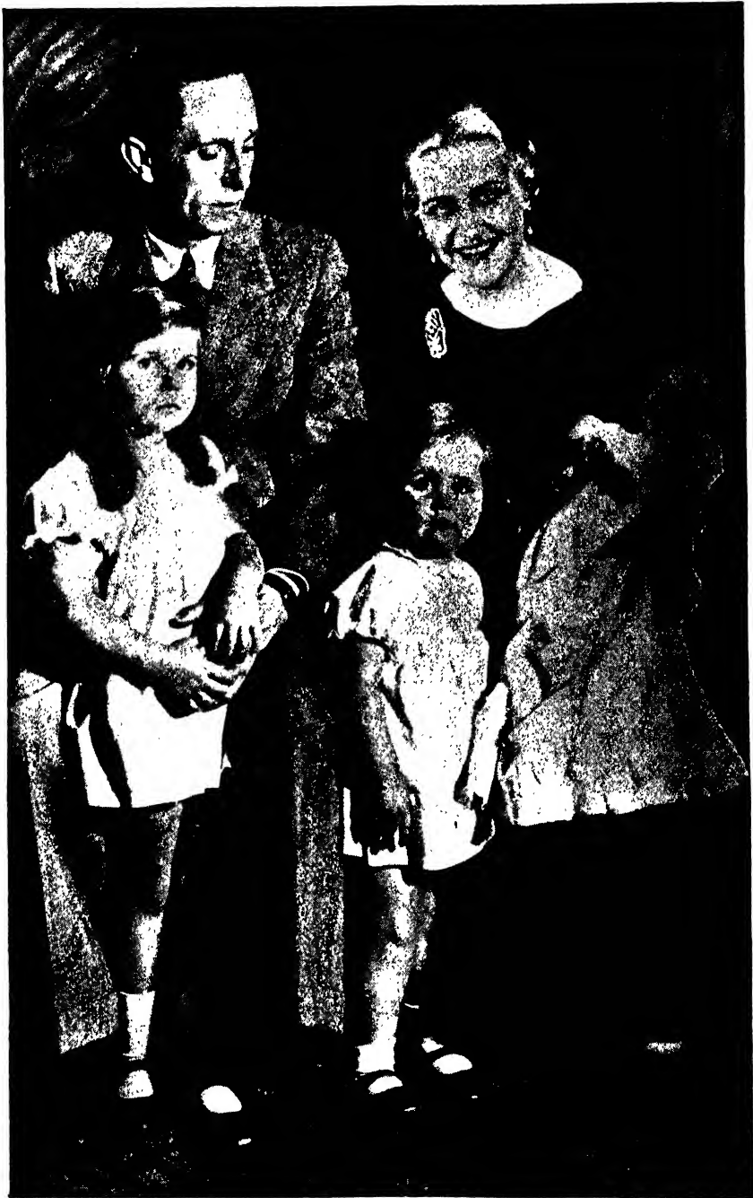
GOEBBELS AND HIS FAMILY