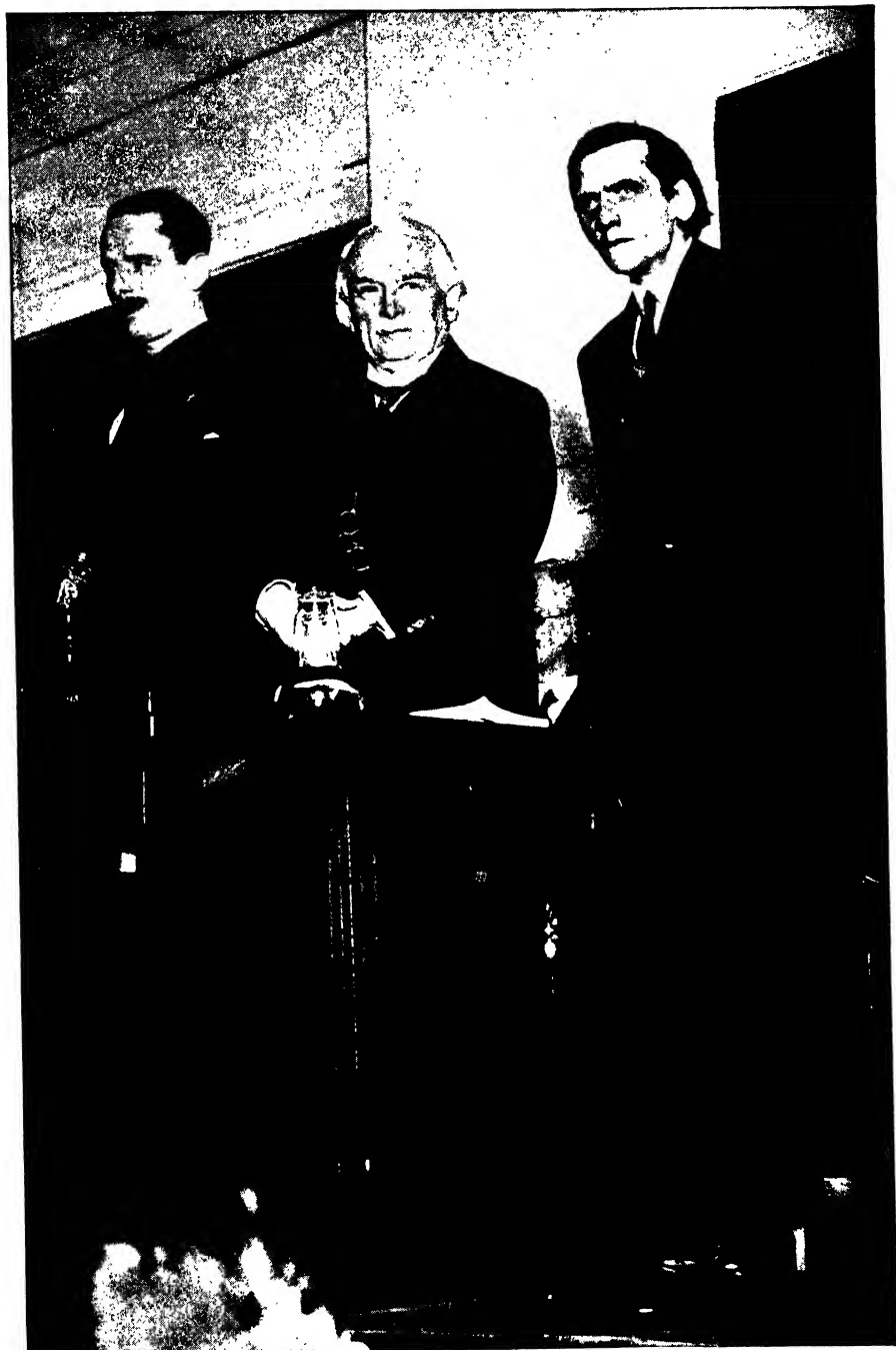
MOSLEY, LLOYD GEORGE AND MAXTON