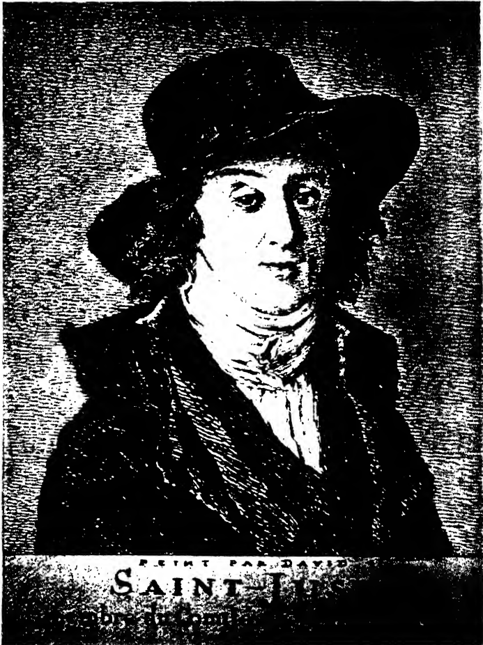
from a painting by David