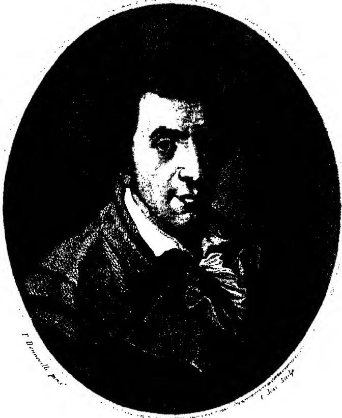
J. P. BRISSOT.