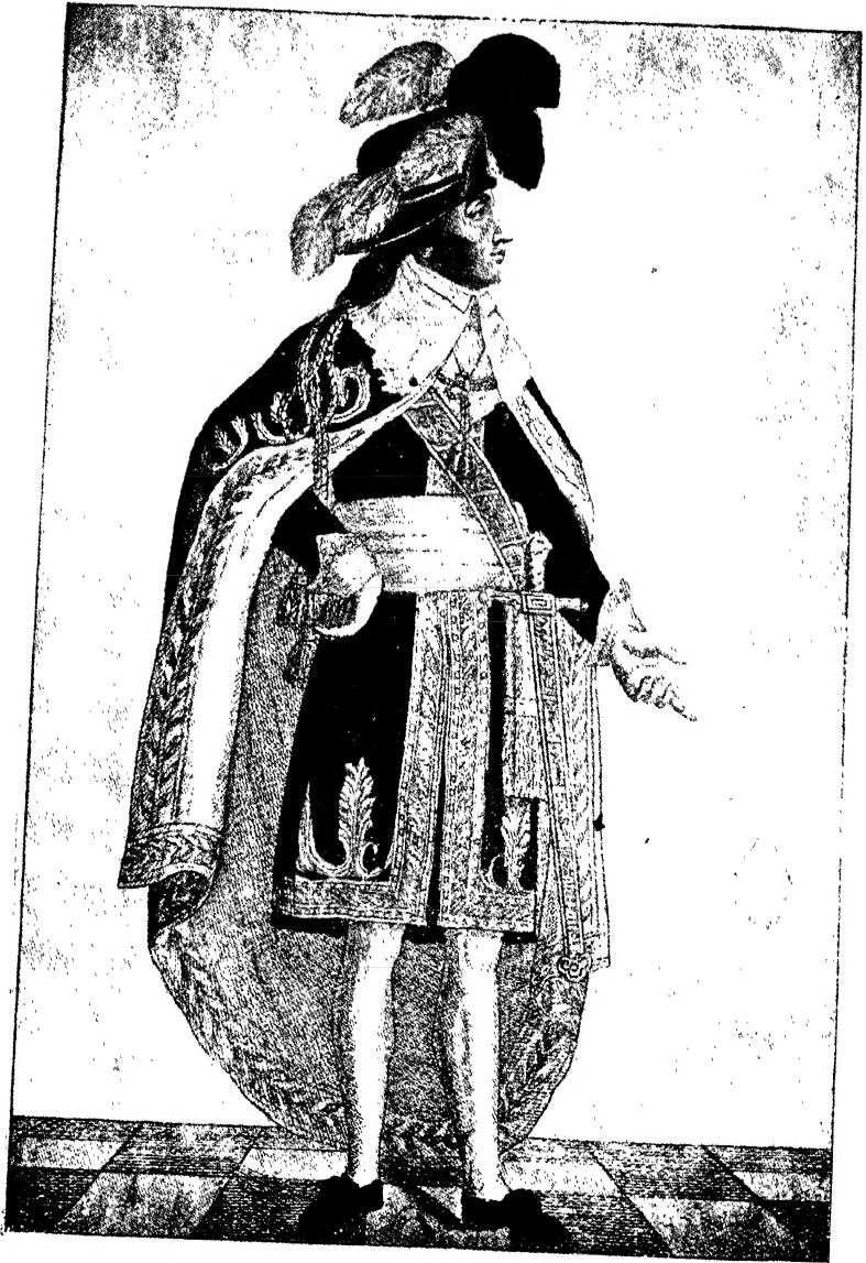
SIEYÈS as a Member of the Directory

from a coloured engraving in the Hennin Collection