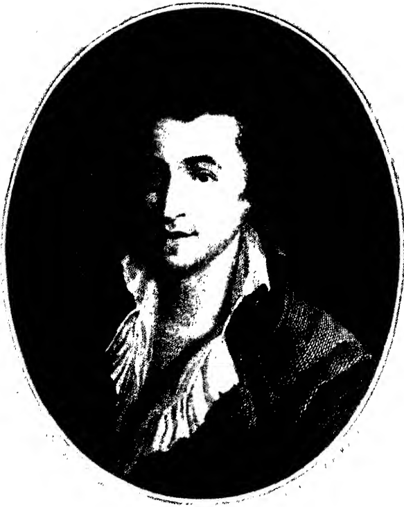
P. F. DE LA HARPE-D'ERLANGEN. Député du Peuple — Paris à la Convention Nationale Nouveau Cercle des Peuples de Paris. Le 20. V. 1793.