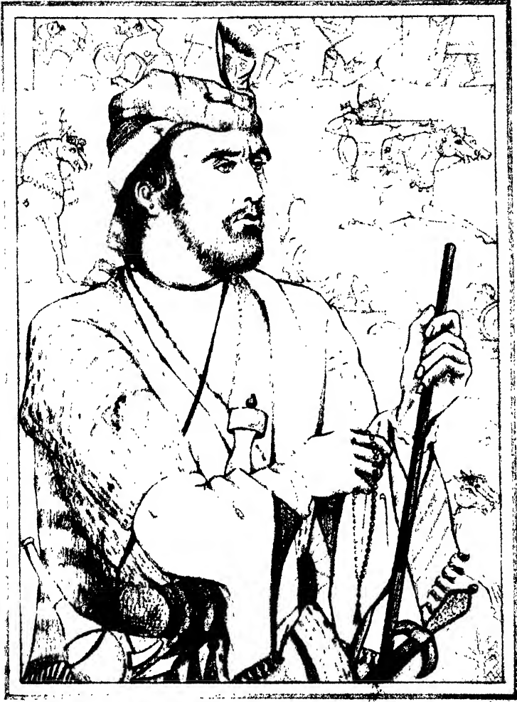
Austen Henry Layard in Bakhtiyari Costume