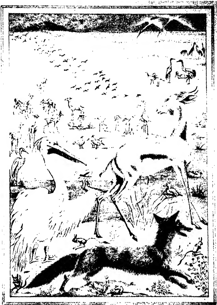
Birds and Animals of the Chól