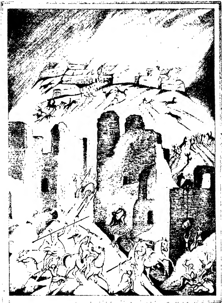
The Looting of the American Camp at Nippur by the Afaq Arabs