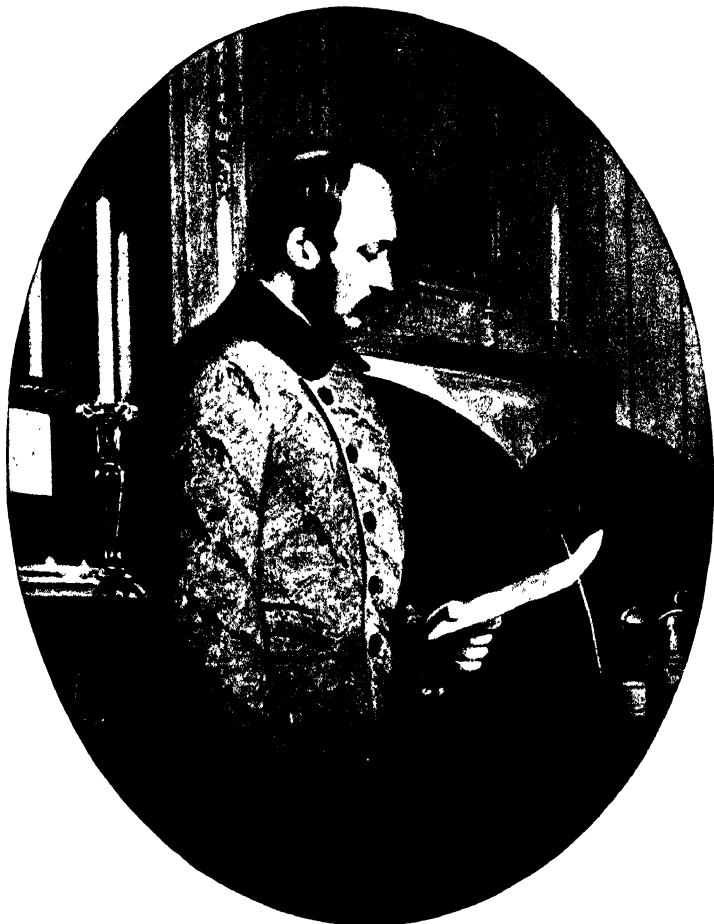
H.R.H. THE PRINCE CONSORT. 1861

From the picture by Smith, after Corbould, at Buckingham Palace