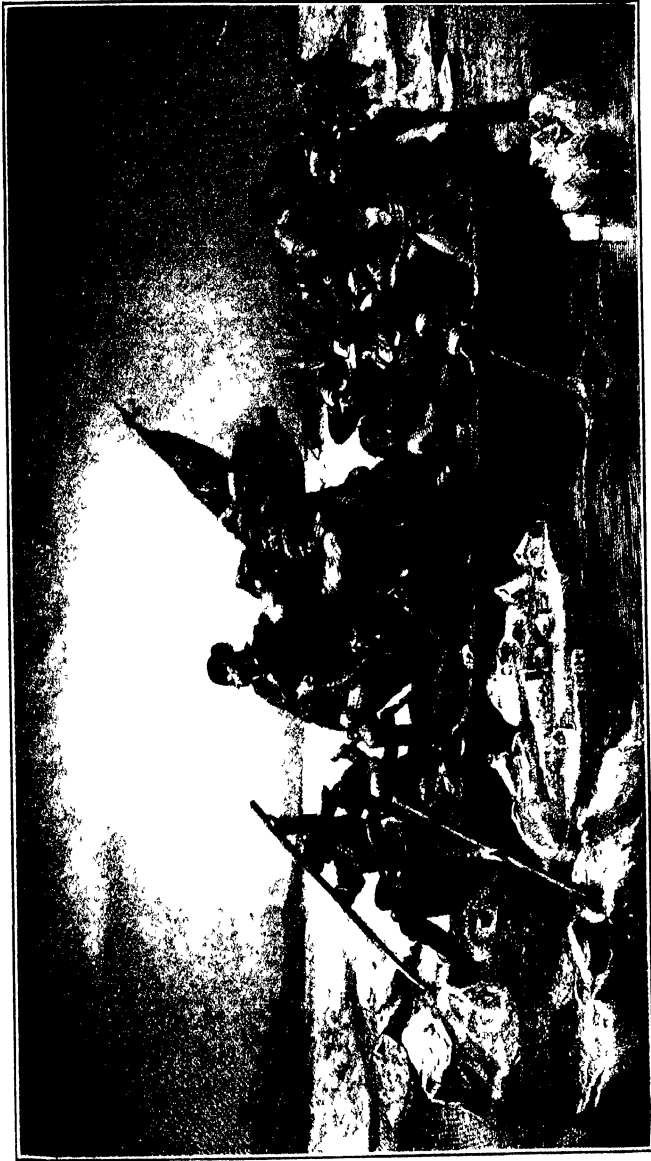
Washington crossing the Delaware