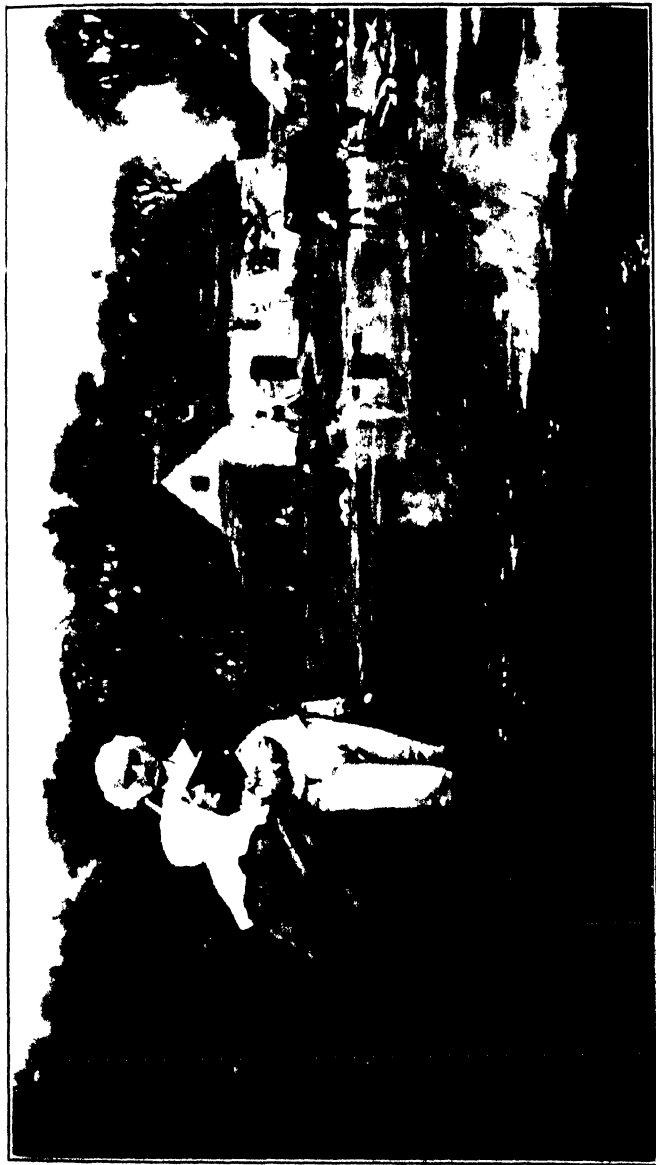
Washington and his Mother