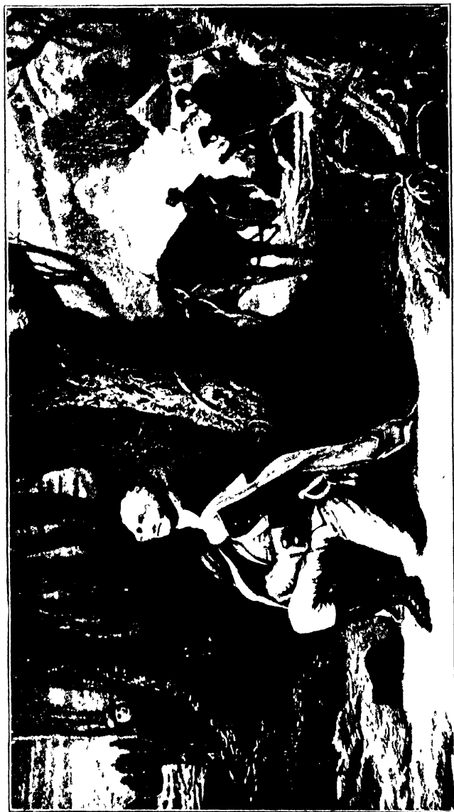
Washington praying at Valley Forge