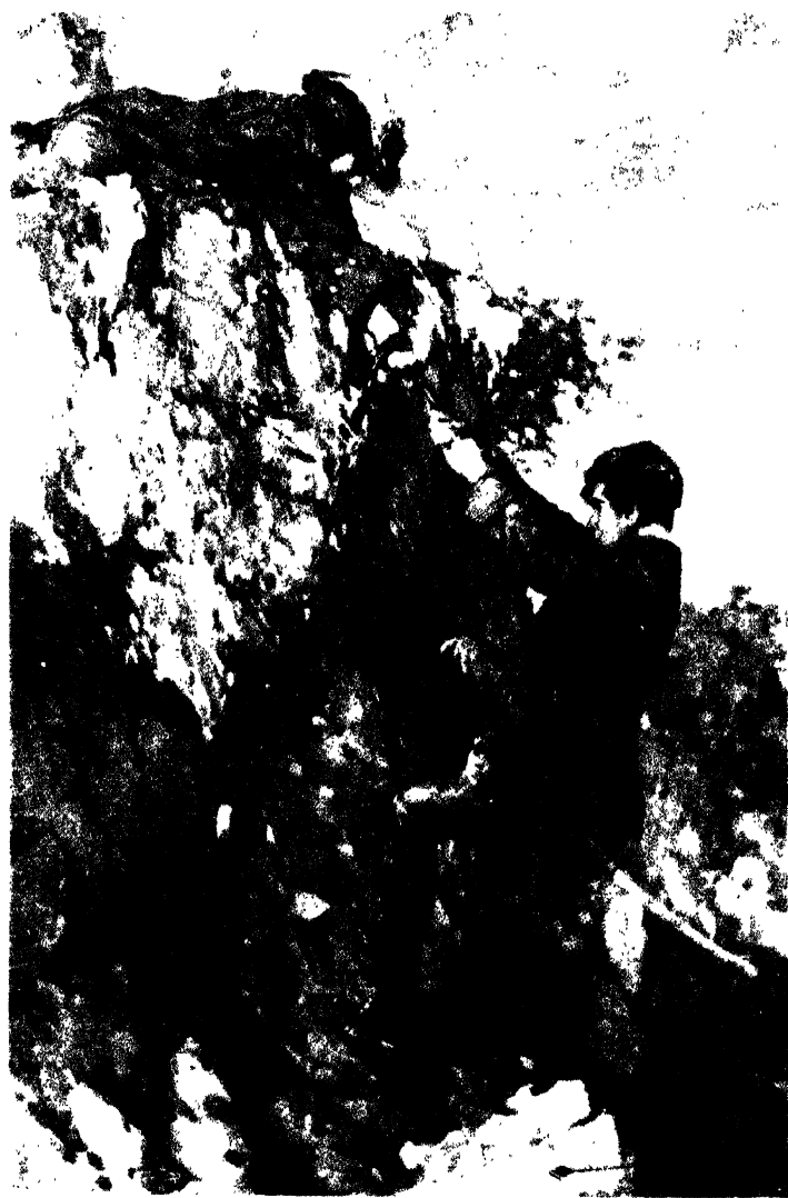
CLIMBING THE ROCKS