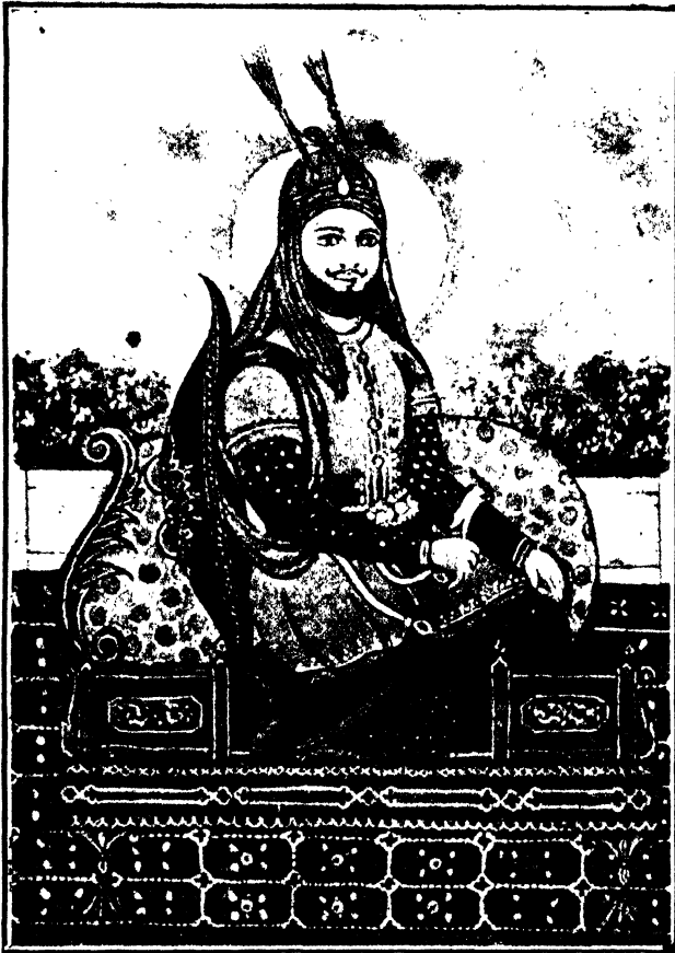
SHER SHAH AFGHAN.