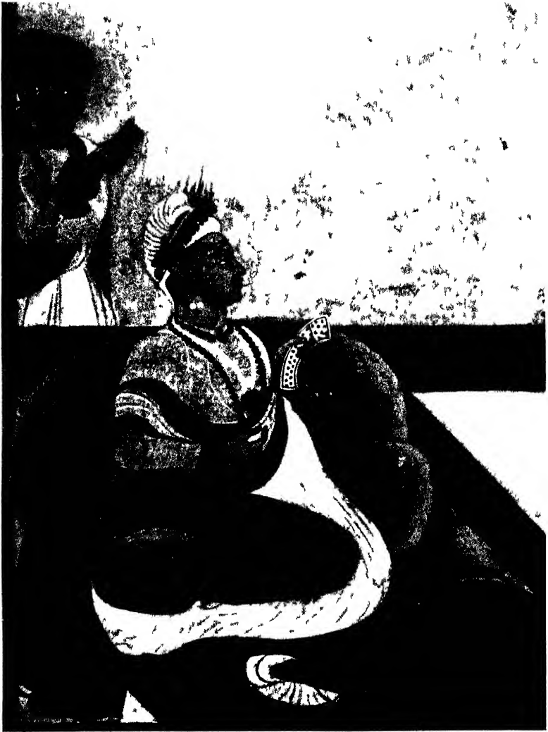
Peshwa Bajirao II