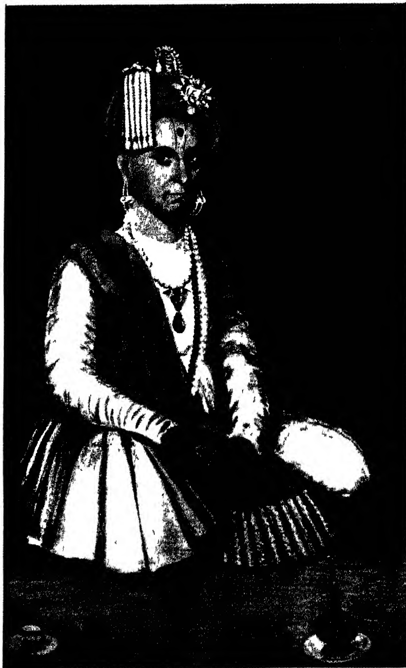
Peshwa Savai Madhavrao