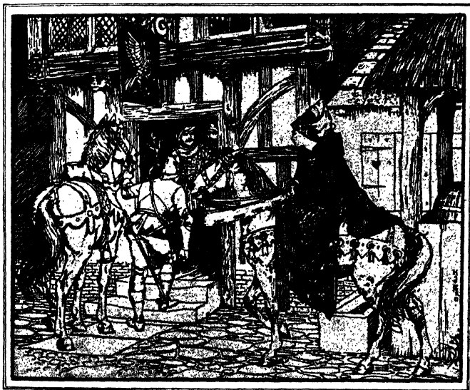
"Elizabeth goes to the inn to meet the conspirators"

'Let us do our business in all haste,' said Stanley, 'as time presses.' And he began shortly to state his scheme for sending Humphrey Brereton over to France