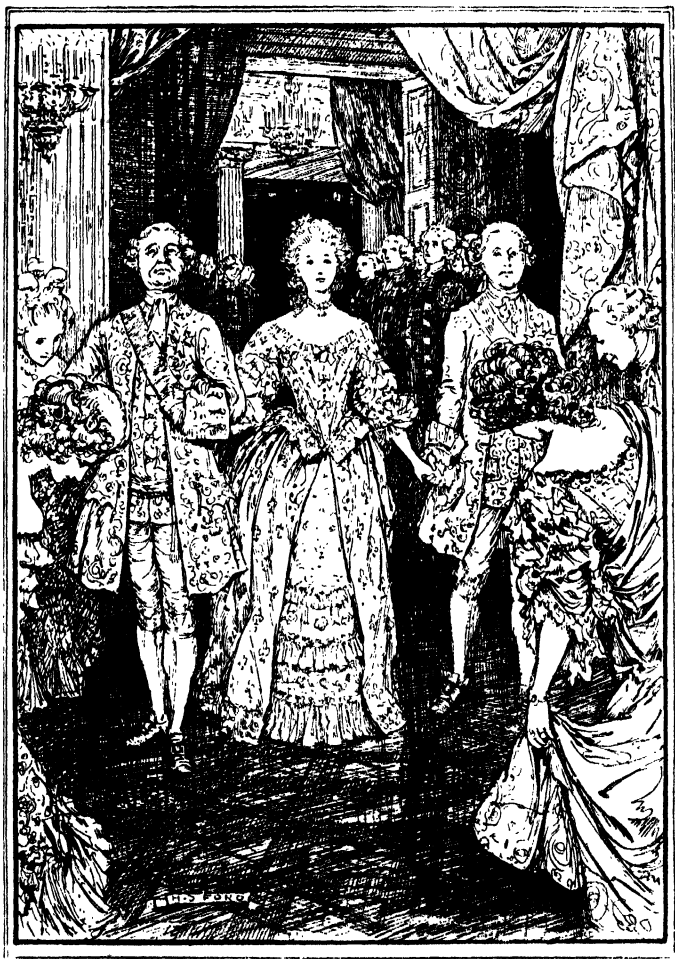
"Led by the King and the Dauphin"