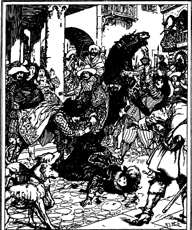
Two Spanish gentlemen rescue the Queen

the two gentlemen to be summoned before him that he might give them his own thanks and that of the queen for rescuing a life so dear to him at the peril of their own.