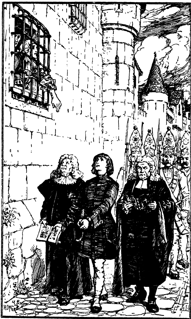
FREDERICK BIDS FAREWELL TO KATTE