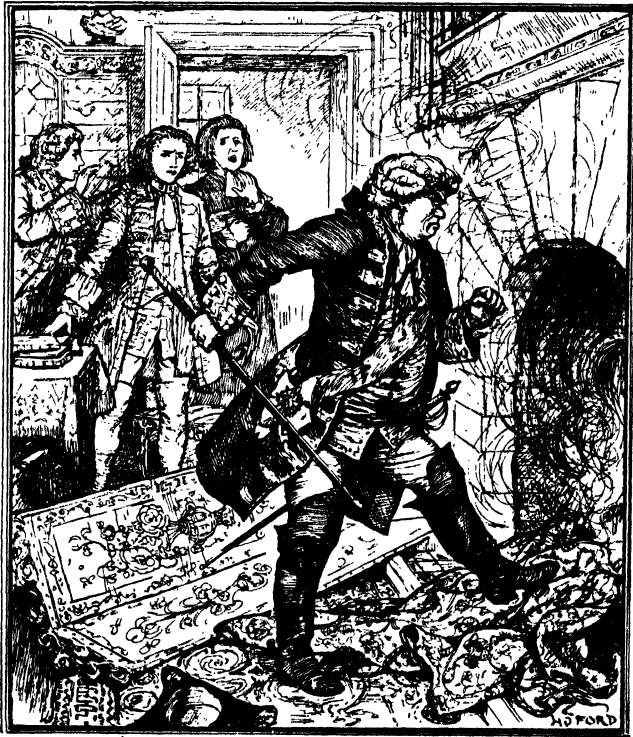
He stamped it down with his heavy boot

during an attack of gout, he aimed a blow with his crutch at Wilhelmine. The girl sprang aside, and it fell harmless, but this only increased the king's fury, and he called to the attendants to push his chair quickly so that