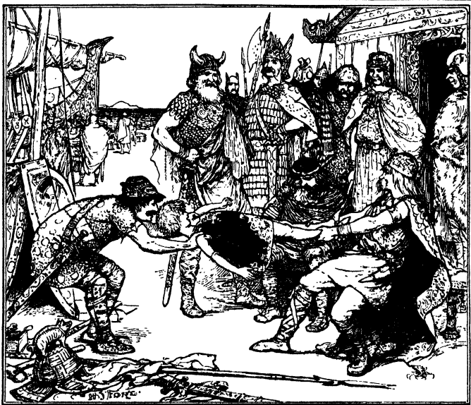
"To make him grow taller"

became a proverb in the land. All men loved him, for he always had merry words on his tongue and took nothing amiss. But for his years he was small, and often the Birchlegs would take him by his head and heels and pull him out, 'to make him grow taller,' they said, but he never grew above middle stature.