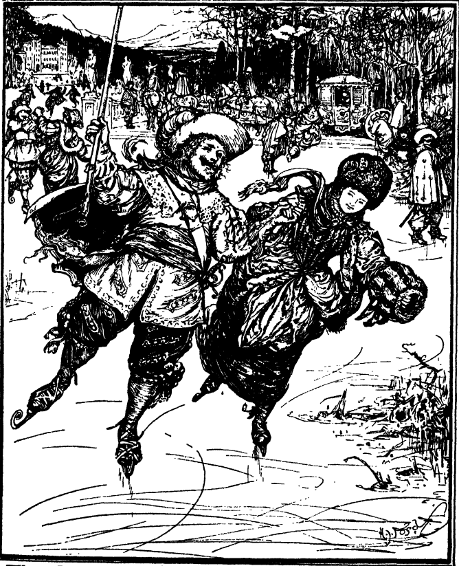
The Queen envies the Flemish skaters

It was certainly very surprising, and the fact that Spanish ladies could at that time skate at all was still