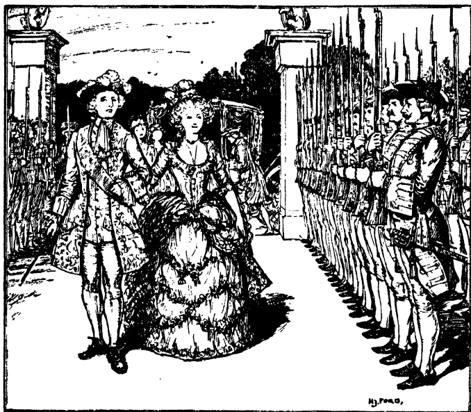
THE SWISS GUARD PRESENT ARMS TO MARIE ANTOINETTE

quite relieved, and glad to spend a few quiet hours with her dog and her lady-in-waiting. Still, just now she was not allowed much time to feel lonely, for she seemed always dressing and undressing to go to some brilliant festivity. One evening a great ball was given, at which even madame Clotilde was allowed to appear, and a young princess of Lorraine, Marie Antoinette's cousin,