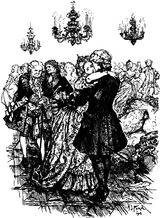
BROTHER & SISTER MEET AGAIN

'Go and embrace the crown prince,' said Grumkow. And she went.