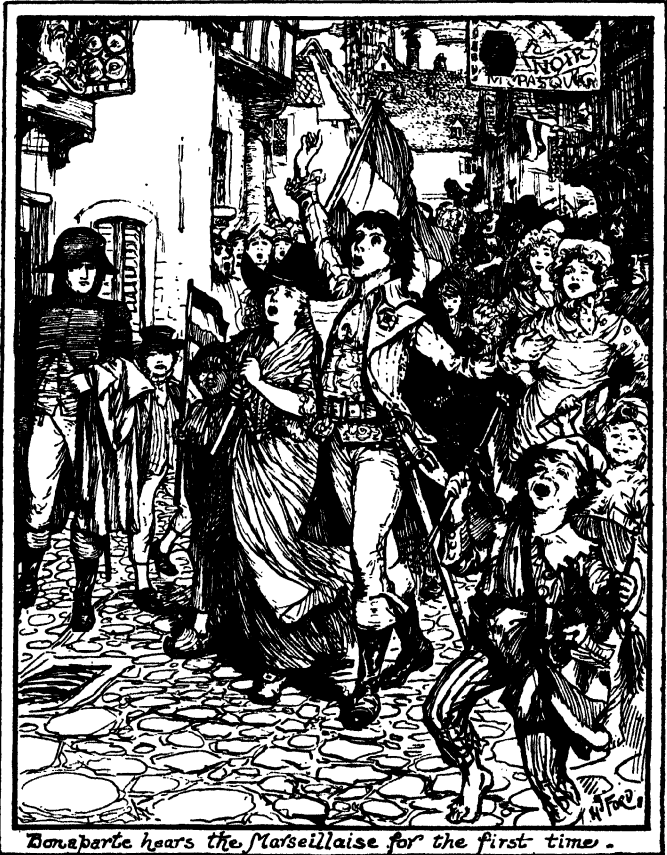
Naparte hears the Marseillaise for the first time.

Louis was a good boy, with generous feelings and a strong sense of duty, which in after-years, when he was