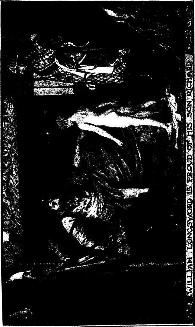
GENERAL WILLIAM LONGSWORD IS PROUD OF HIS SON RICHARD