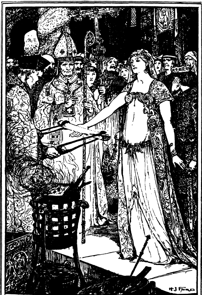
INGA ENDURES THE ORDEAL OF THE HOT IRON