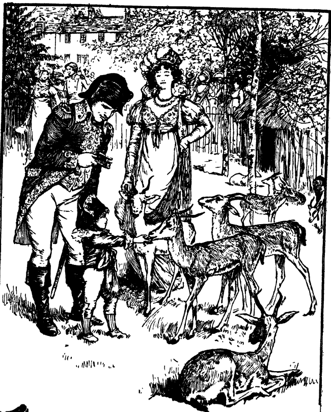
FEEDING THE GAZELLES WITH TOBACCO

when Napoleon pulled his ears, instead of getting angry like his cousins, the little Murats. Every day he did his