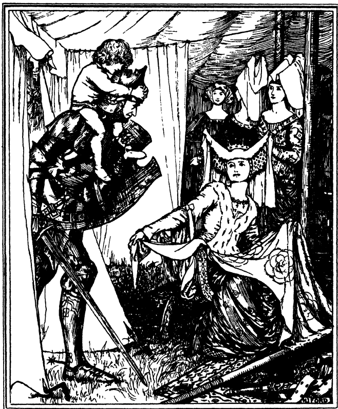
Herbert brings little Henry to his wife's tent

of all the children there, lady Maud, who afterwards became the wife of the earl of Northumberland, and lady Katherine, to whom, many years later, he proposed marriage himself.