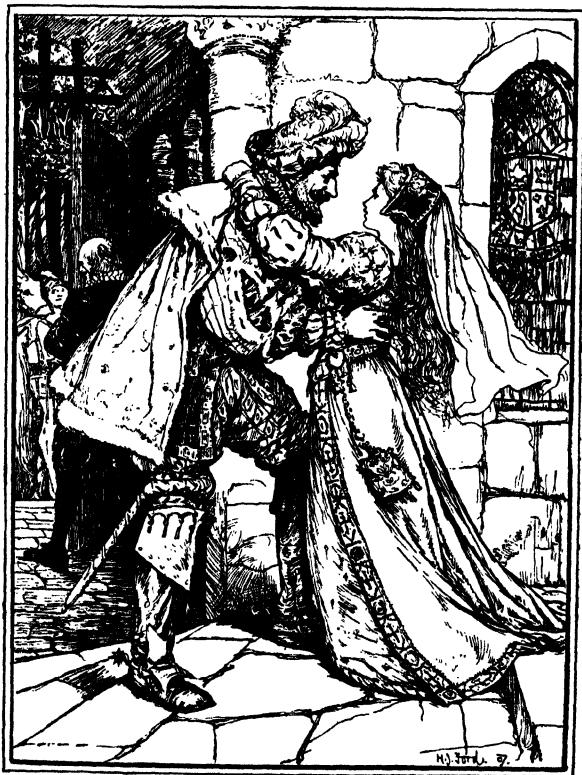
JEANNE AND THE KING