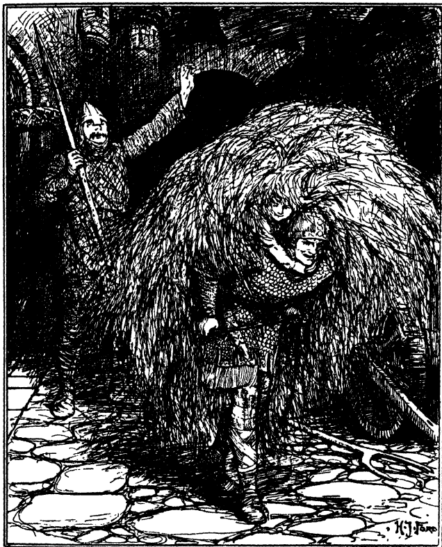
THE TRUSS OF HAY

beating high, Osmond reached the stable, and, choosing a lean black horse, he put on it both saddle and bridle, and led it out by a side door, which opened out on a dark