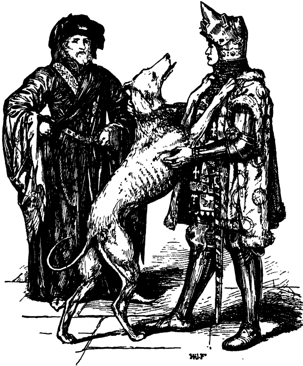
KING RICHARD DUKE HENRY MATH THE GREYHOUND

would play together in the hall, and Math would put his two huge paws on the king's shoulders. And when Math beheld the horses ready saddled, and being led to the spot where Richard and his cousin were standing, he