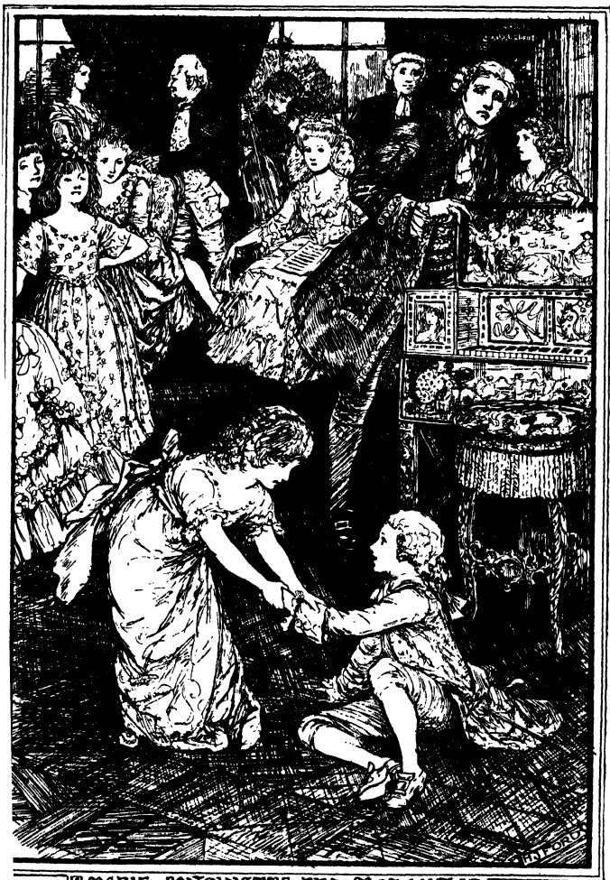
MARIE ANTOINETTE AND MOZART.