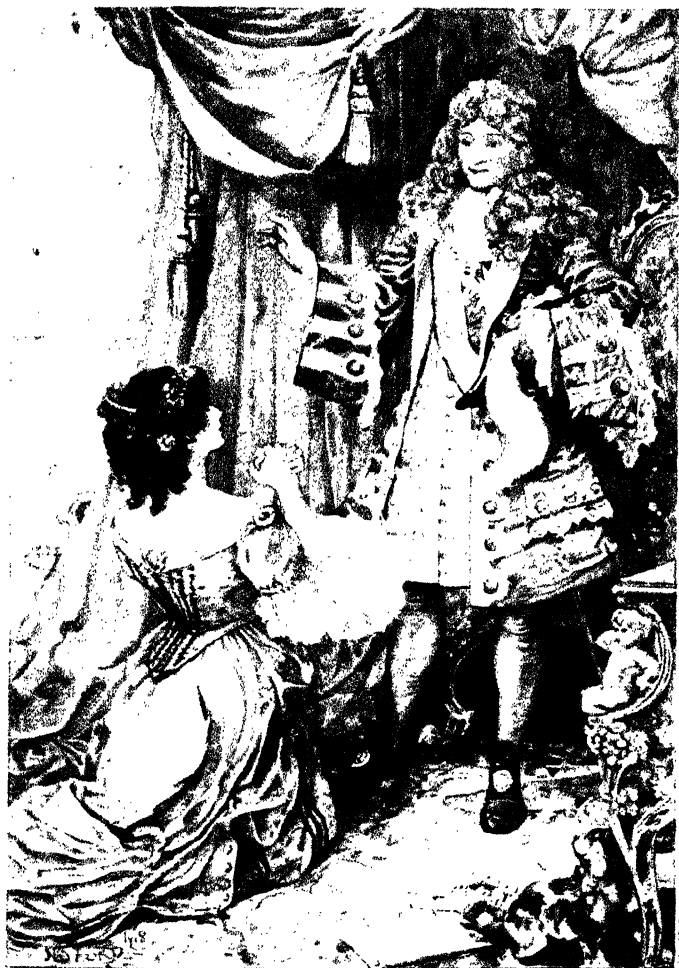
THE LADY OF THE LAMPS