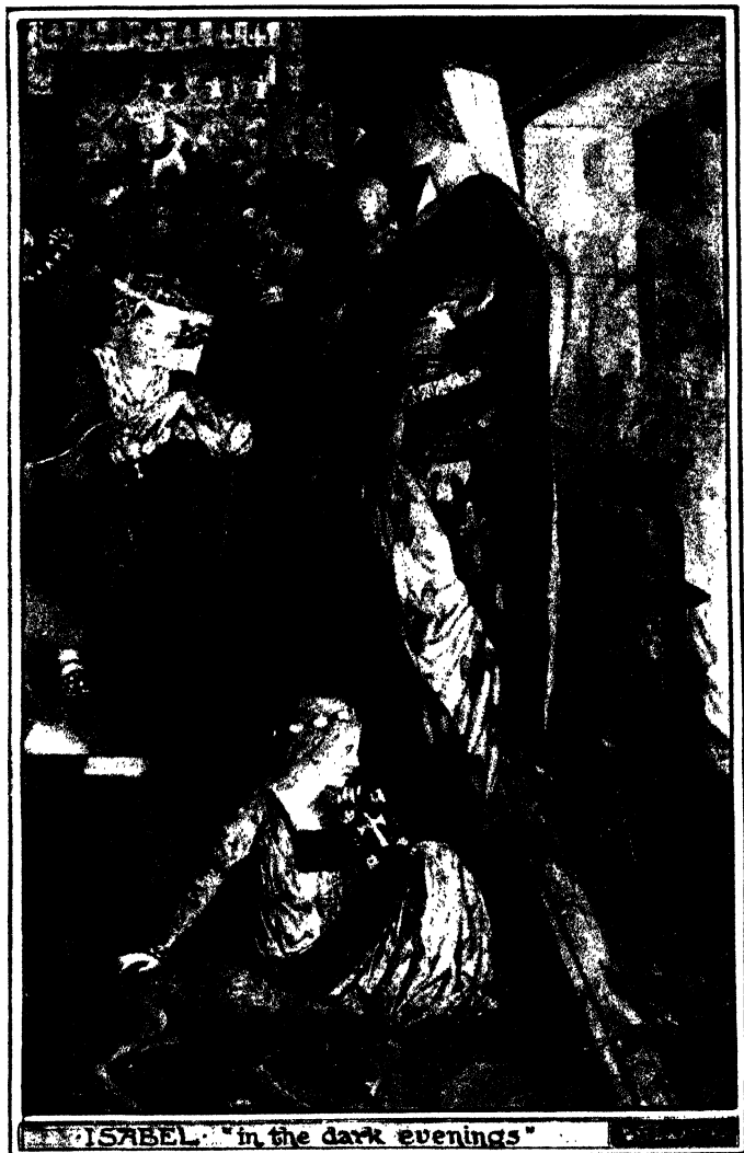
ISABEL: "in the dark evenings"