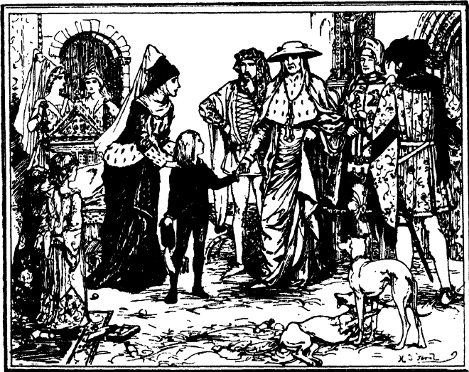
The Queen entrusts little Richard to the Cardinal

Elizabeth bowed her head in silence—it was no more than she had expected, and she awaited in the strength of despair what was to follow. It was not long in coming. Ten days later Richard III. was crowned in the Abbey with great splendour, and her brothers