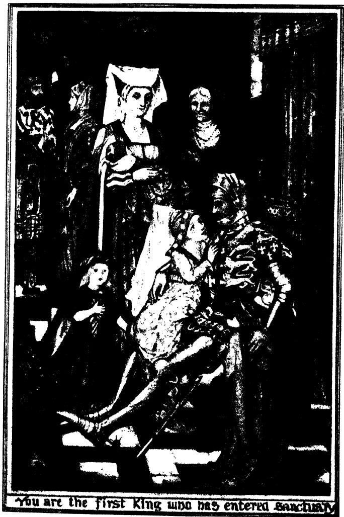
You are the first King who has entered sanctuary