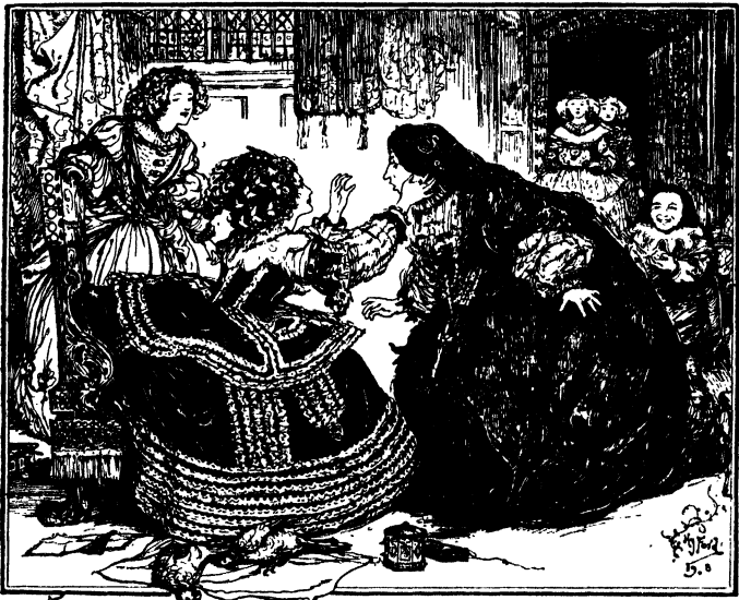
The Gamatera Mayor gets her ears boxed!

as much as from the blow, but her furious words were checked on her tongue at the sight of the still, pale girl whose face was so new to her. Leaving the room, she summoned all her relations, and, choking with anger, she informed them of the insult she had received; then, accompanied by no less than four hundred kinsfolk, all belonging to noble families, she went to complain to the king.