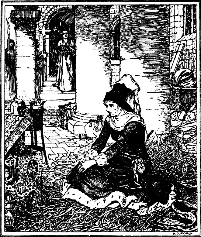
"Desolate and dismayed."

Richard, the 'married man,' had quietly fallen asleep in a corner on a heap of wall-hangings that happened to have been set down there. So it was that the arch-