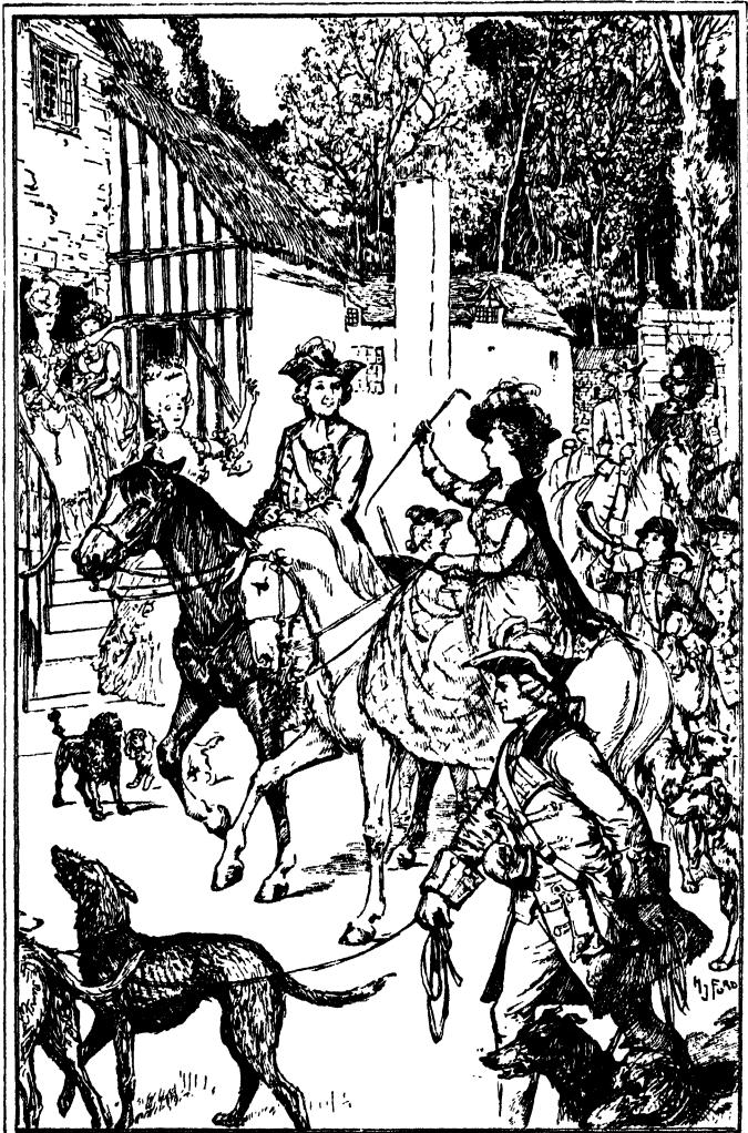
MARIE ANTOINETTE GOES HUNTING WITH THE DAUPHIN