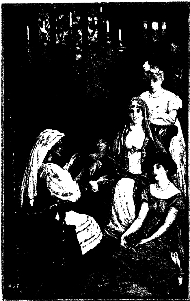
! CAMILLA TELLS HER TALE !