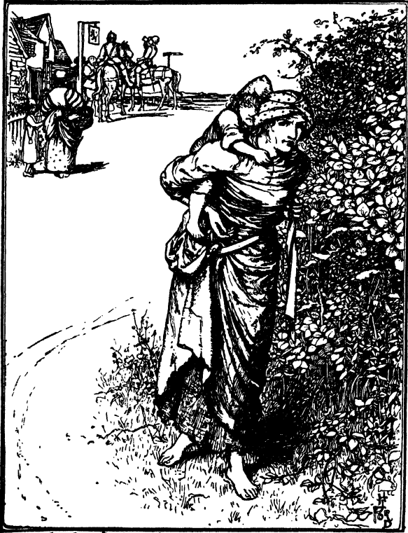
Lady Dalkeith's journey to Dover

with them to Paris, and found there that she was almost as much a heroine as Henrietta Maria. But, indeed, misfortune only appeared to have doubled their friends, and everyone at court tried to see how much kindness