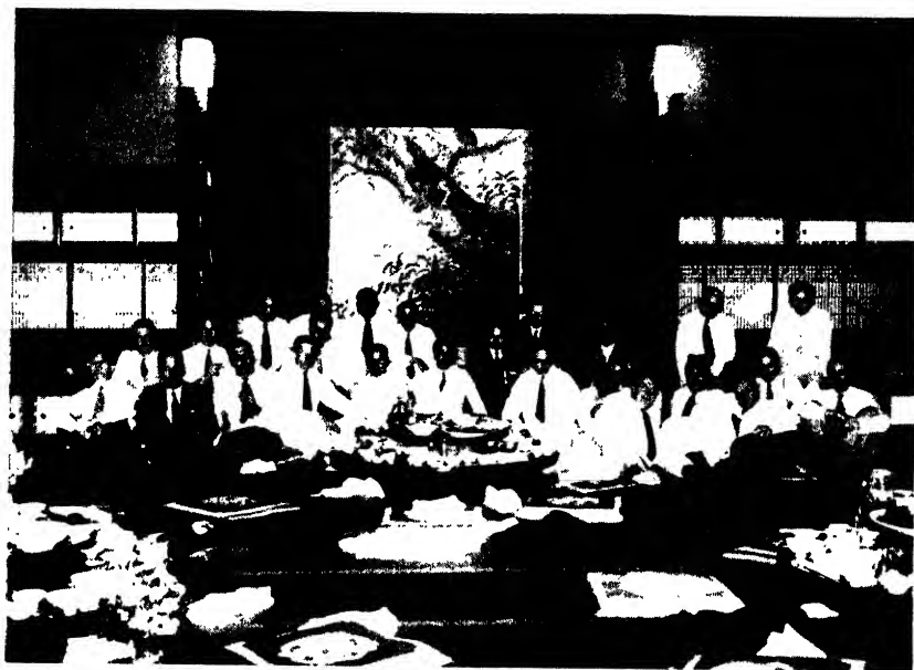
The Ambassador and staff of the American Embassy enjoy a Japanese dinner.