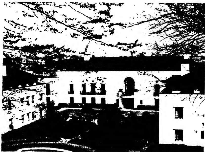
Office building and apartment houses of the American Embassy. The Imperial Diet building is in the background.