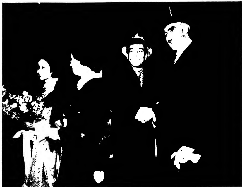
Manuel Quezon, then President of the Philippine Islands, arrives in Tokyo, 1937.