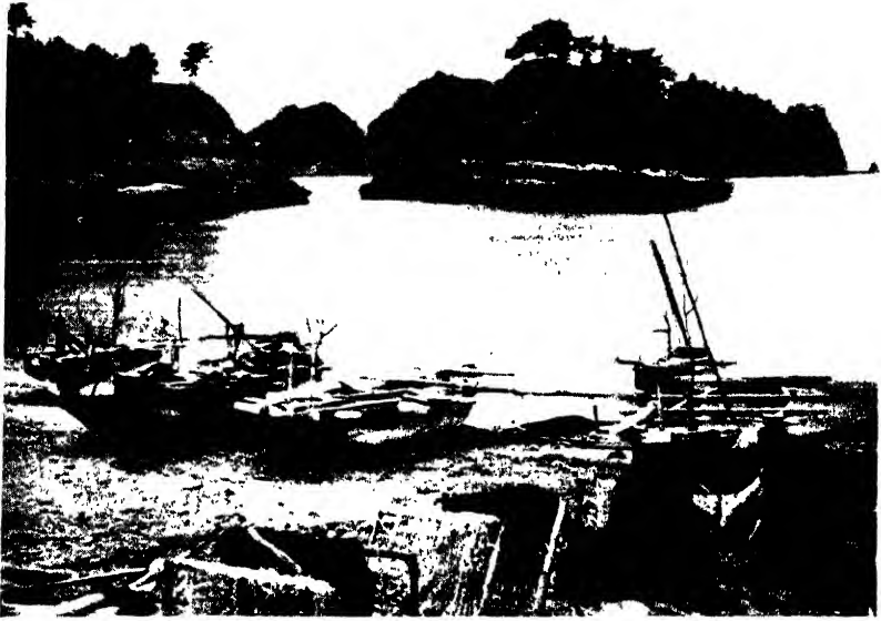
Along the coast of the Izu Peninsula, near where Commodore Perry landed.