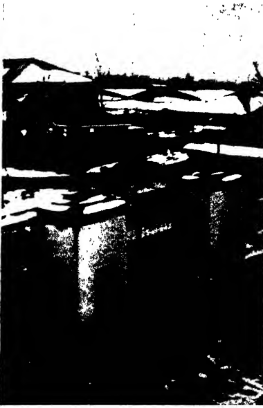
A tank passing through the street outside the Embassy.