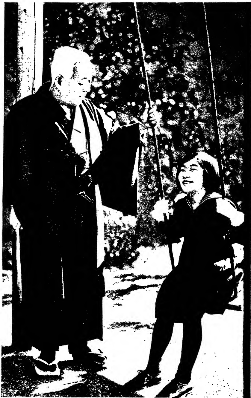
Admiral Viscount Saito, assassinated in the February 26 Incident, and his granddaughter.