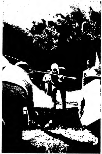
Imperial Duck Hunt.