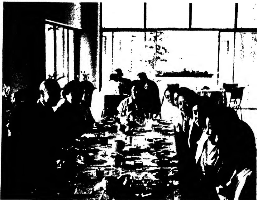
The Ambassador attends the Tokyo Golf Club's annual luncheon for the winners of the women's tournament.