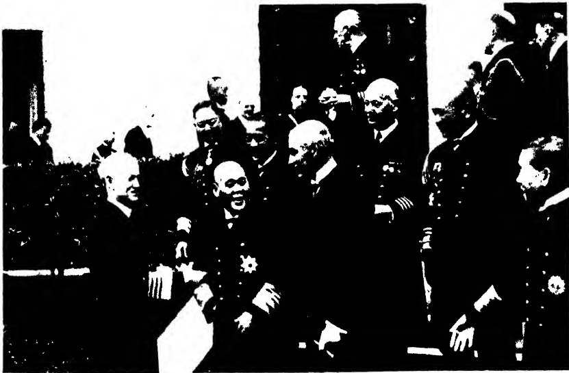
Admiral Murfin, former Commander-in-Chief of the United States Asiatic Fleet ; Admiral Nagano, Navy Minister, and Ambassador Grew. Admiral Shimada, present Commander of the Japanese Fleet in China, is second from right.