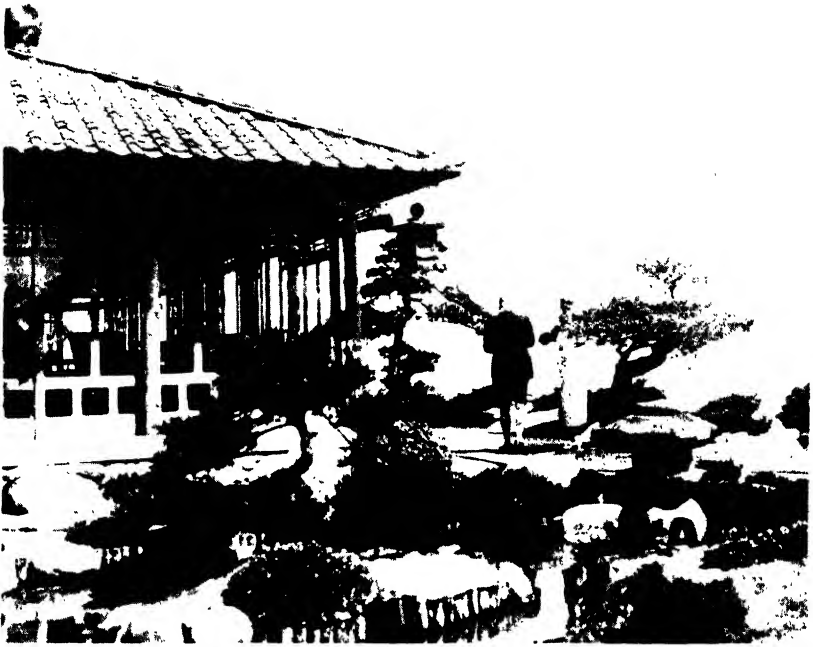
A Japanese country villa.