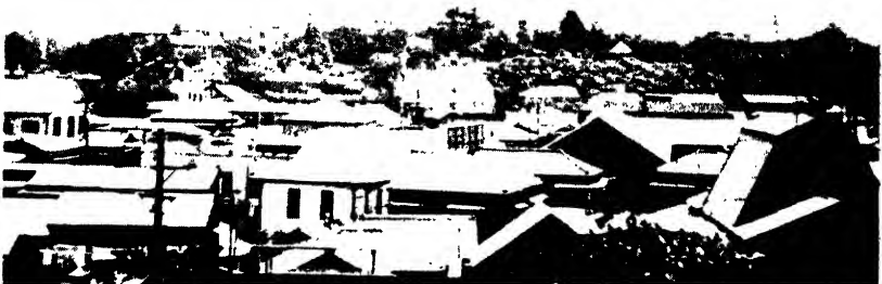
A view of the rooftops of Tokyo, taken from the American Embassy. The prominent building in the background is the Imperial Diet.