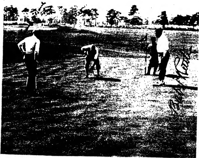
Babe Ruth and "Lefty" O'Doul stare at Ambassador Grew's method of putting.