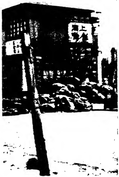
Sandbags in front of the American Embassy.