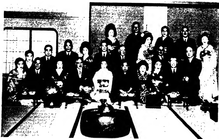
The Ambassador attends a geisha dinner.