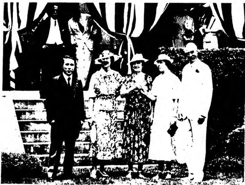
Helen Keller visits the Embassy garden. Left to right : Foreign Minister Hirota, Mrs. Grew, Helen Keller and her companion, and Ambassador Grew.