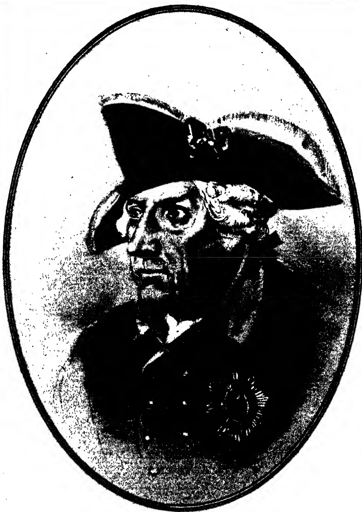
Frederick the Great