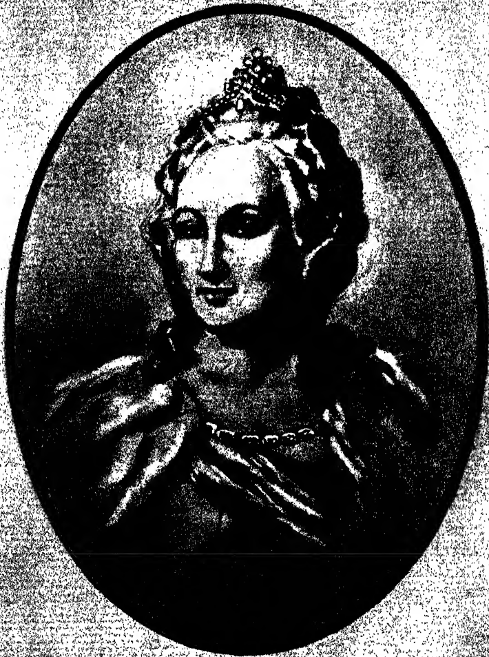
Catherine the Great