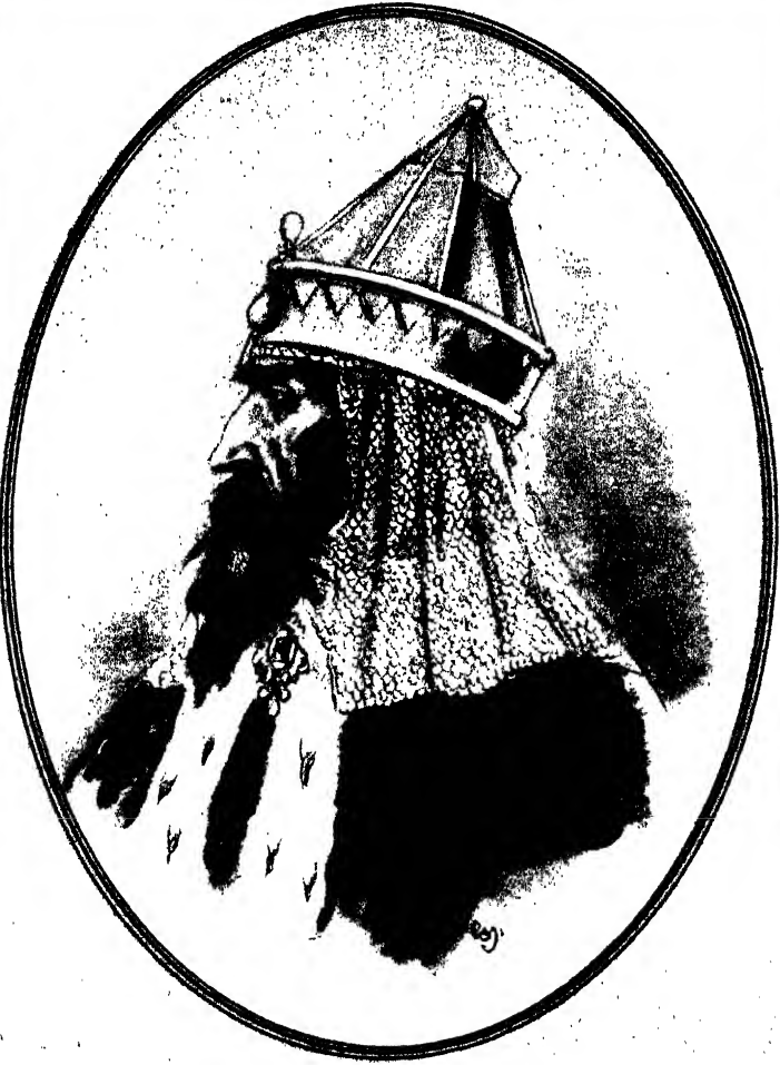
Ivan the Terrible