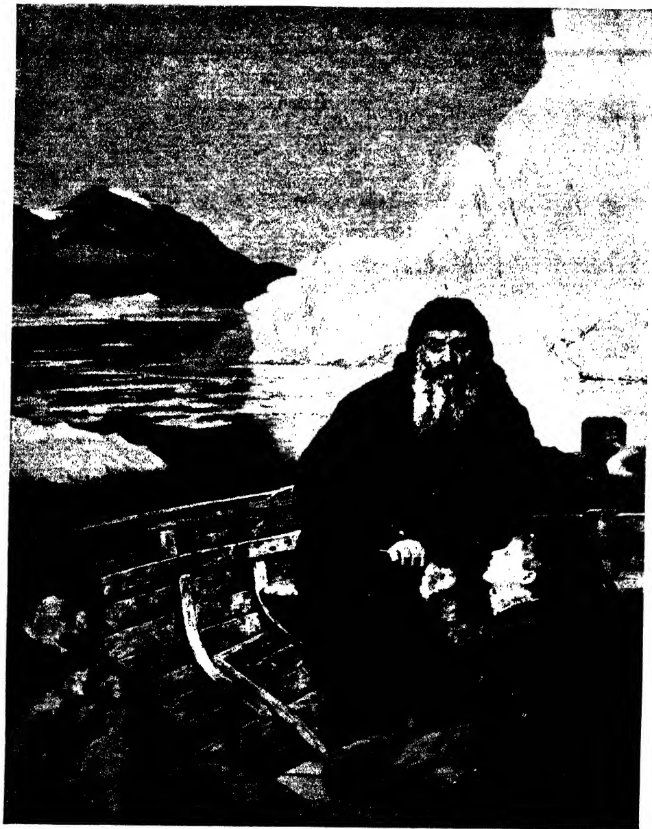
THE LAST VOYAGE OF HENRY HUDSON ( Page 258 ) FROM THE PAINTING BY SIR JOHN COLLIER