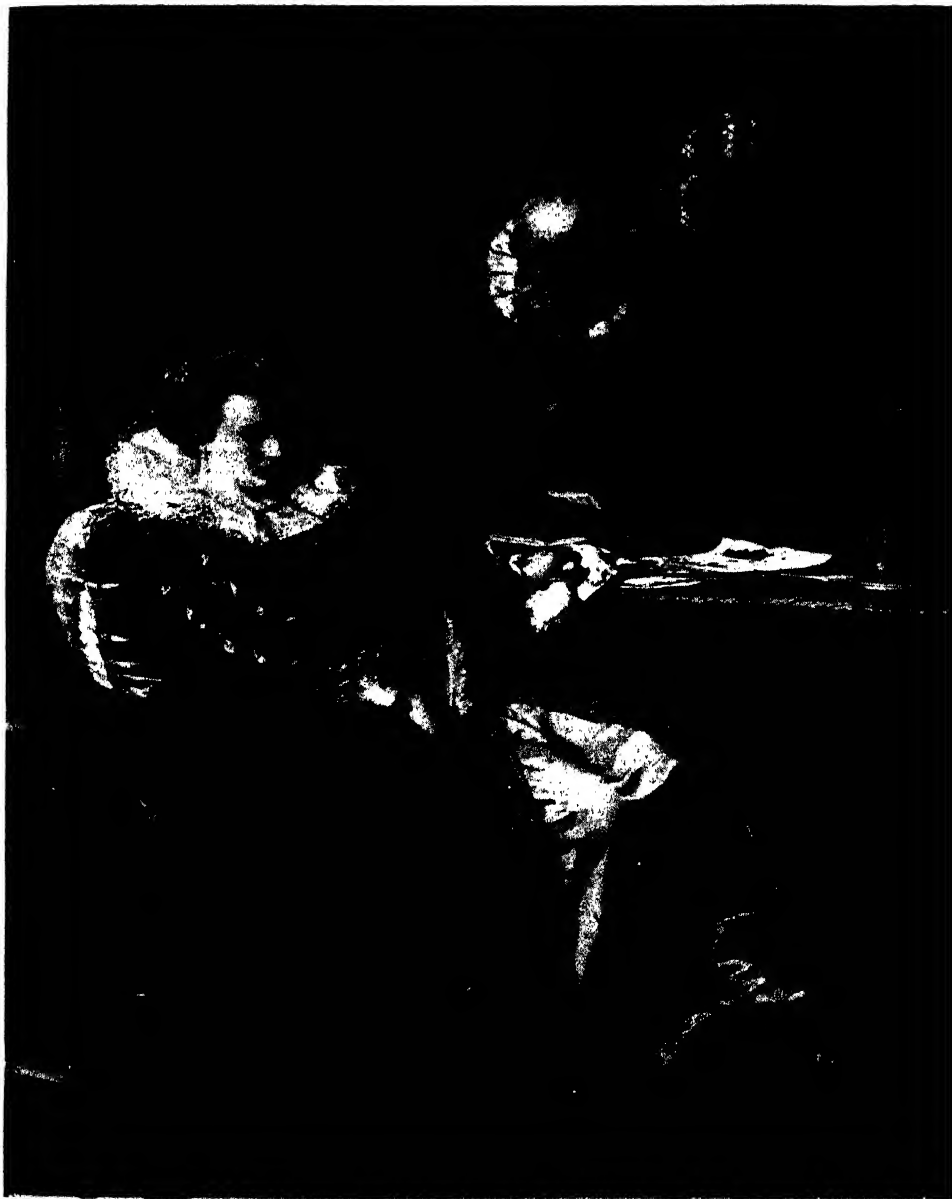
ELIZABETH SIGNING THE DEATH WARRANT OF MARY STUART (Page 174)