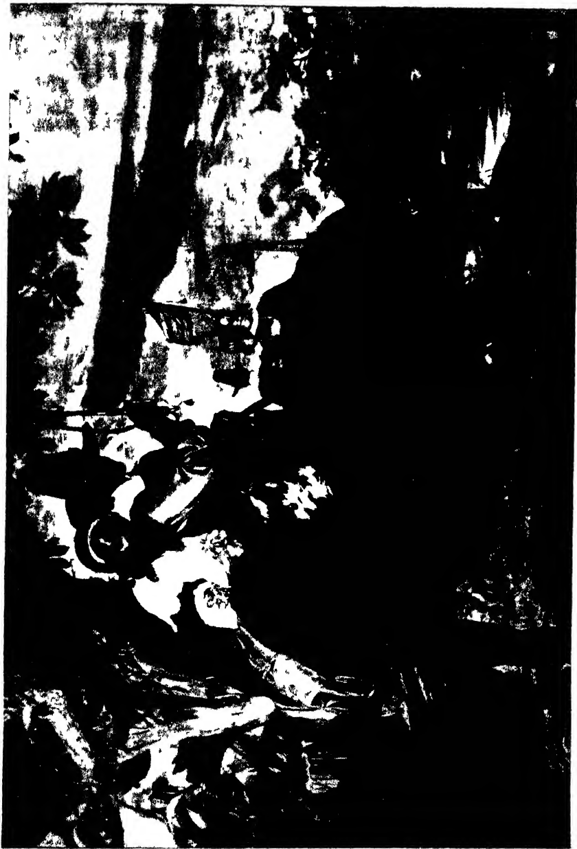
CHARLES II. ESCAPING FROM THE PARLIAMENTARY FORCES (Page 316)