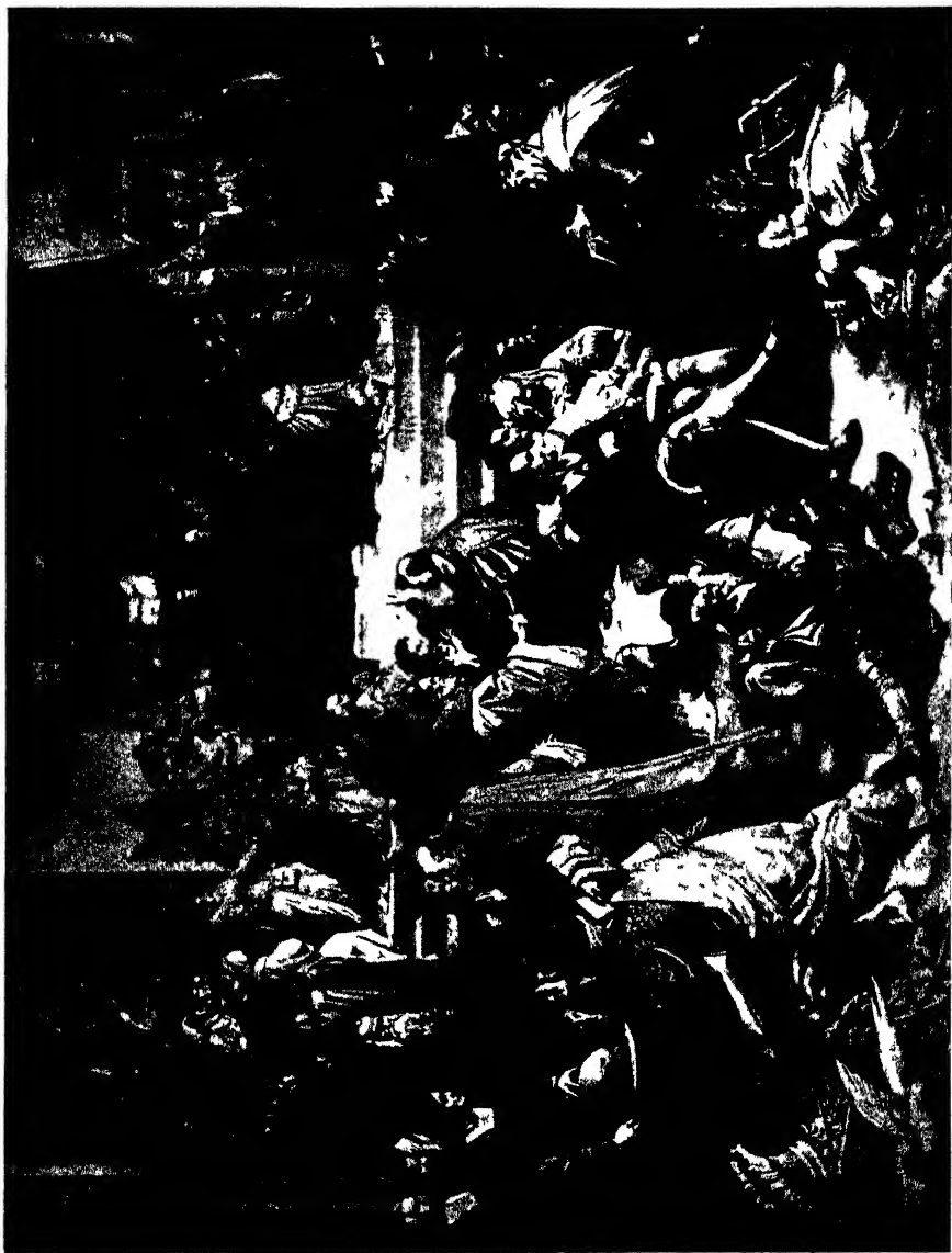
THE AGE OF THE REFORMATION (Pages 27-38)