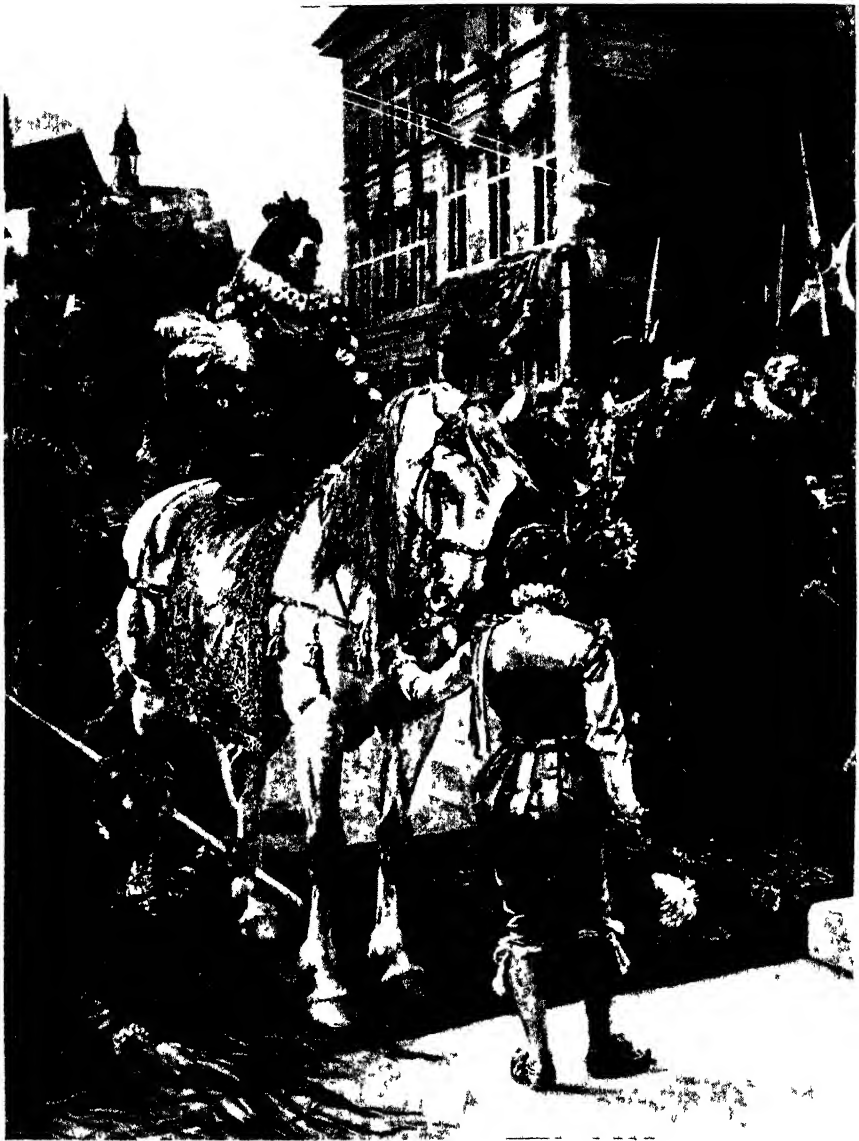
QUEEN ELIZABETH I ATTENDING A LONDON CEREMONY AT THE TIME OF THE SCOTTISH REFORMATION (Pages 125-139)