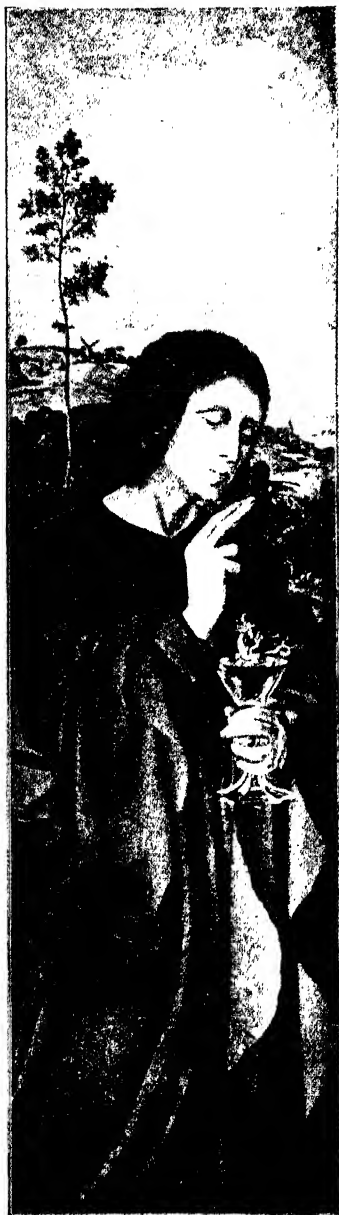
THE DRAGON IN THE GOBLET.