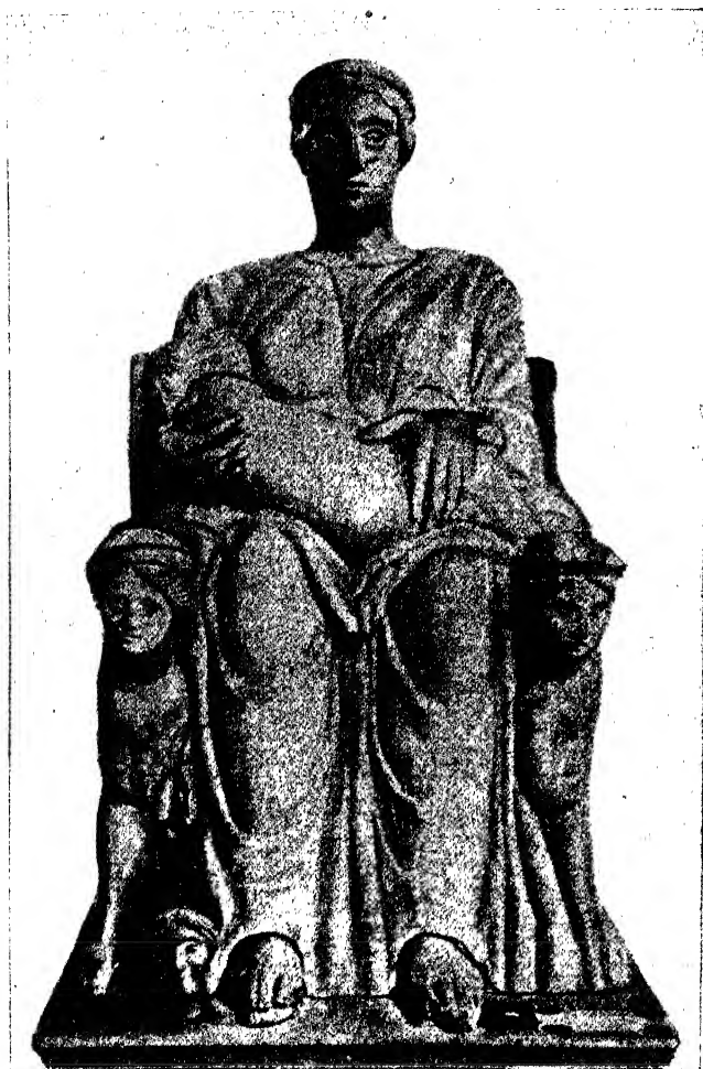
MATUTA, AN ETRUSCAN PIETA.