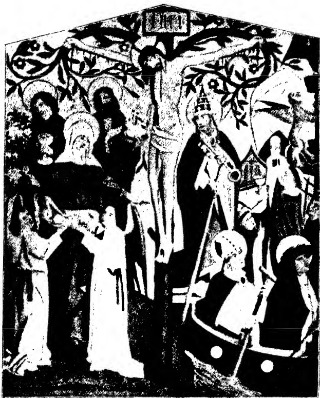
CHRIST ON THE TREE OF LIFE.