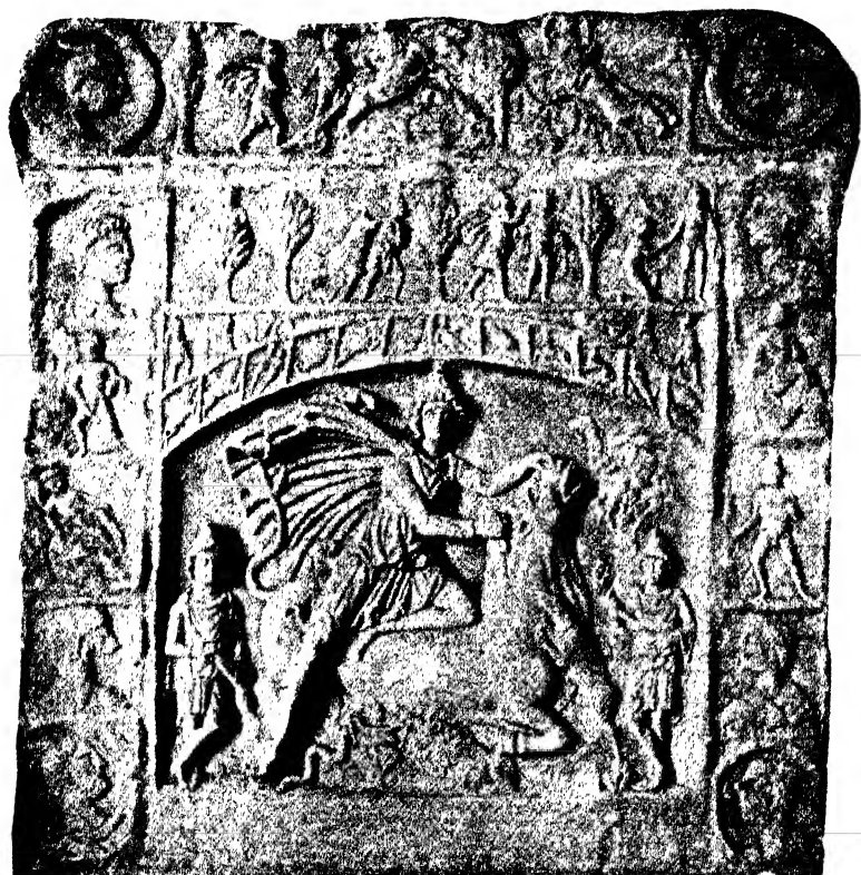
BULL-SACRIFICE OF MITHRA.