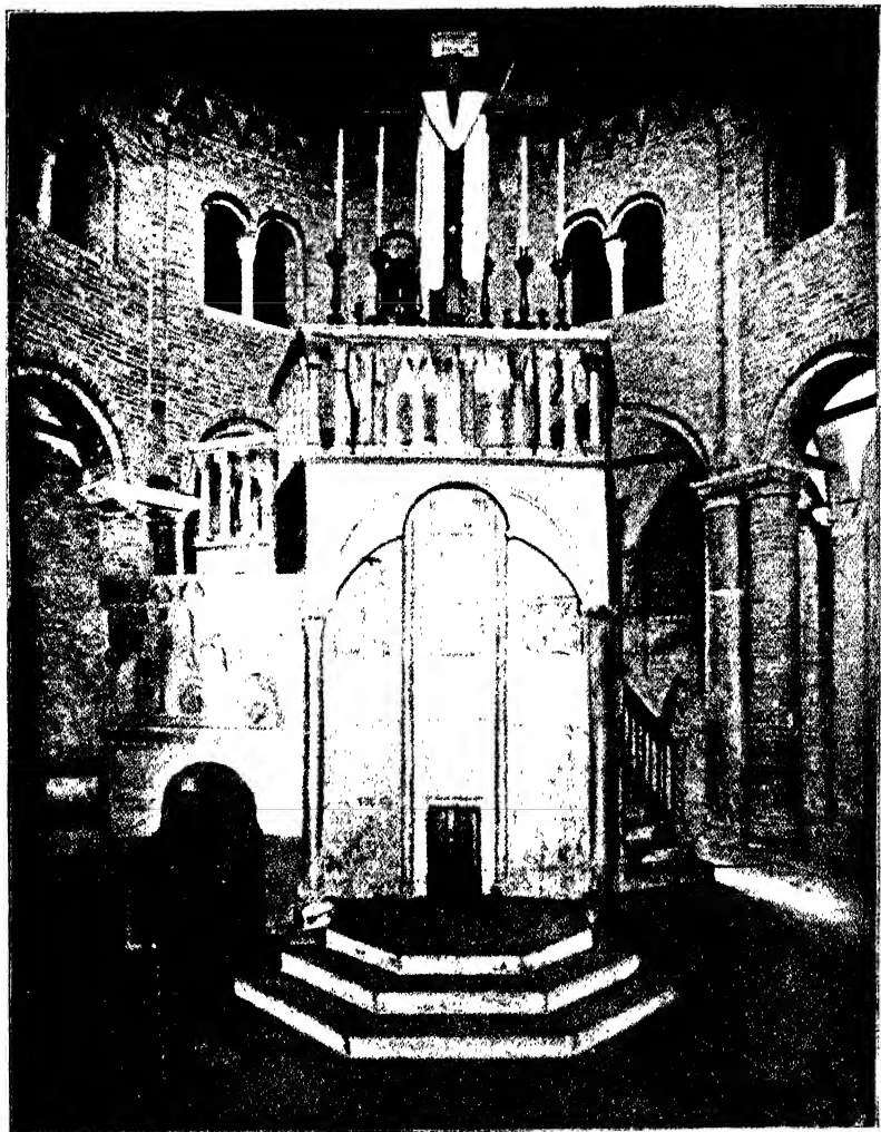
THE SO-CALLED HOLY SEPULCHRE OF S. STEFANO, AT BOLOGNA.