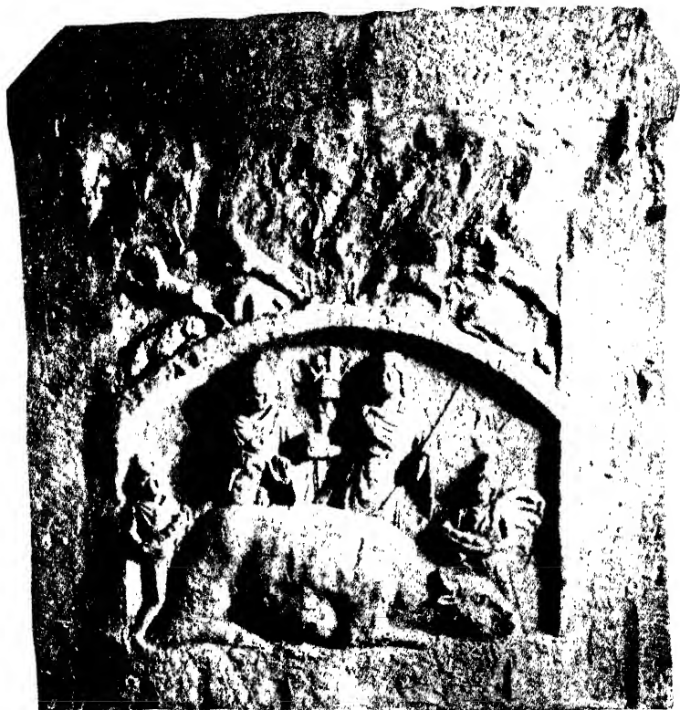
FRUCTIFICATION FOLLOWING UPON THE MITHRAIC SACRIFICE.