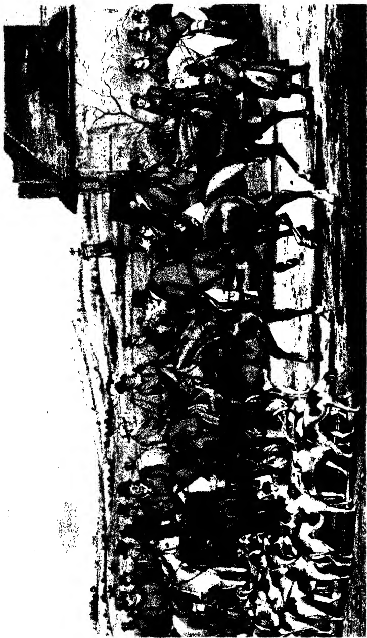
MR. JORROCKS INTRODUCES THE YORKSHIREMAN TO THE SURREY.