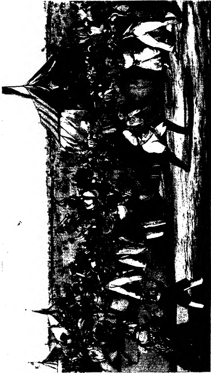
MR. JORROCKS BEATS THE BARON FOR SPEED.