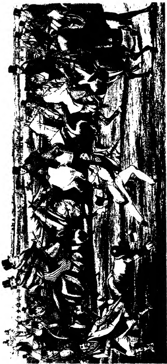
M r . JORROCKS MAKES HIS ENTREE INTO THE NEWMARKET BETTING RING.