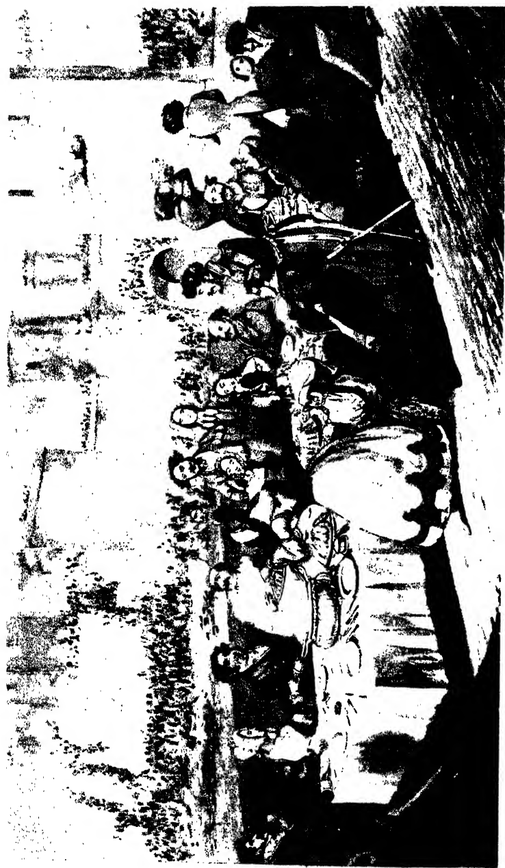
"WATER I DO DECLARE — WITH WORMS IN IT."