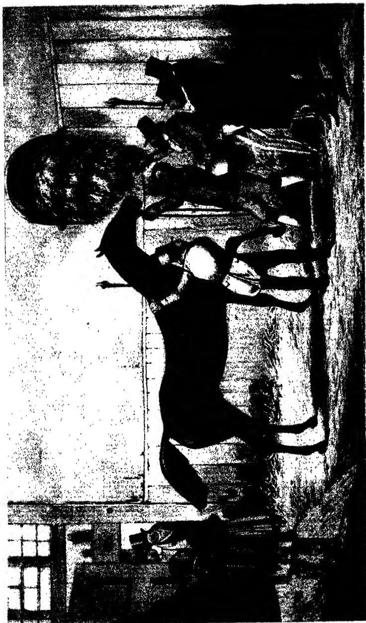
THE BARON "VILLS HIS WET."