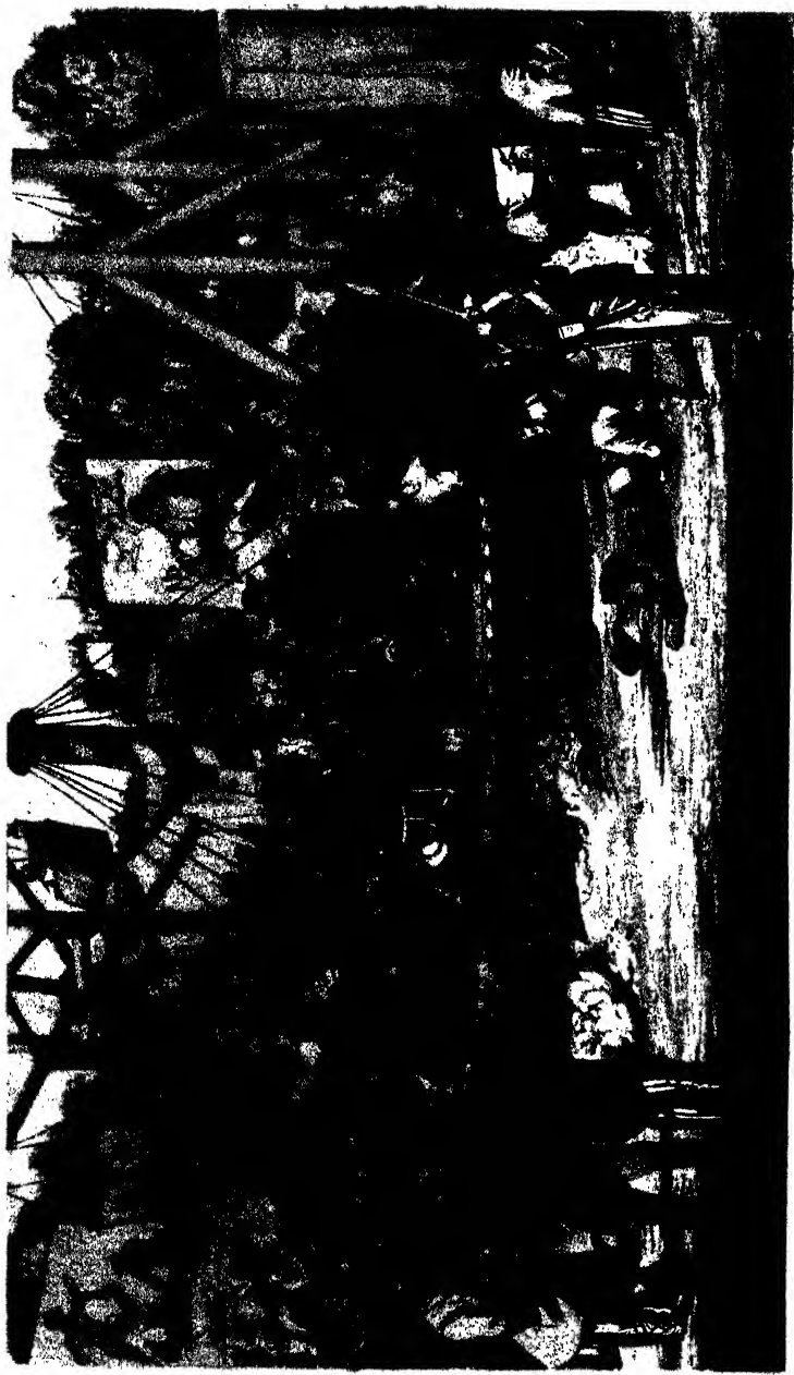
MR. JORROCKS TAKES A RIDE AT ST. CLOUD.