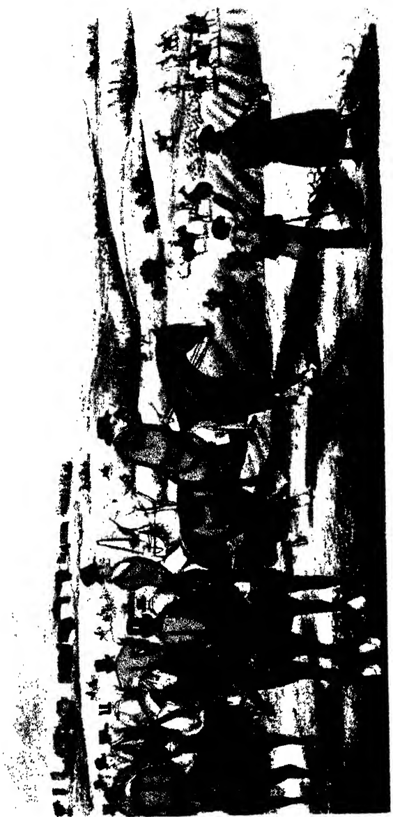
MR. JORROCKS' TELEGRAPHS' THE FOX.