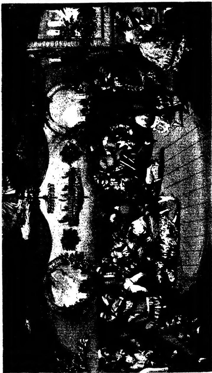
MR. JORROCKS MAKES A FAUX PAS.