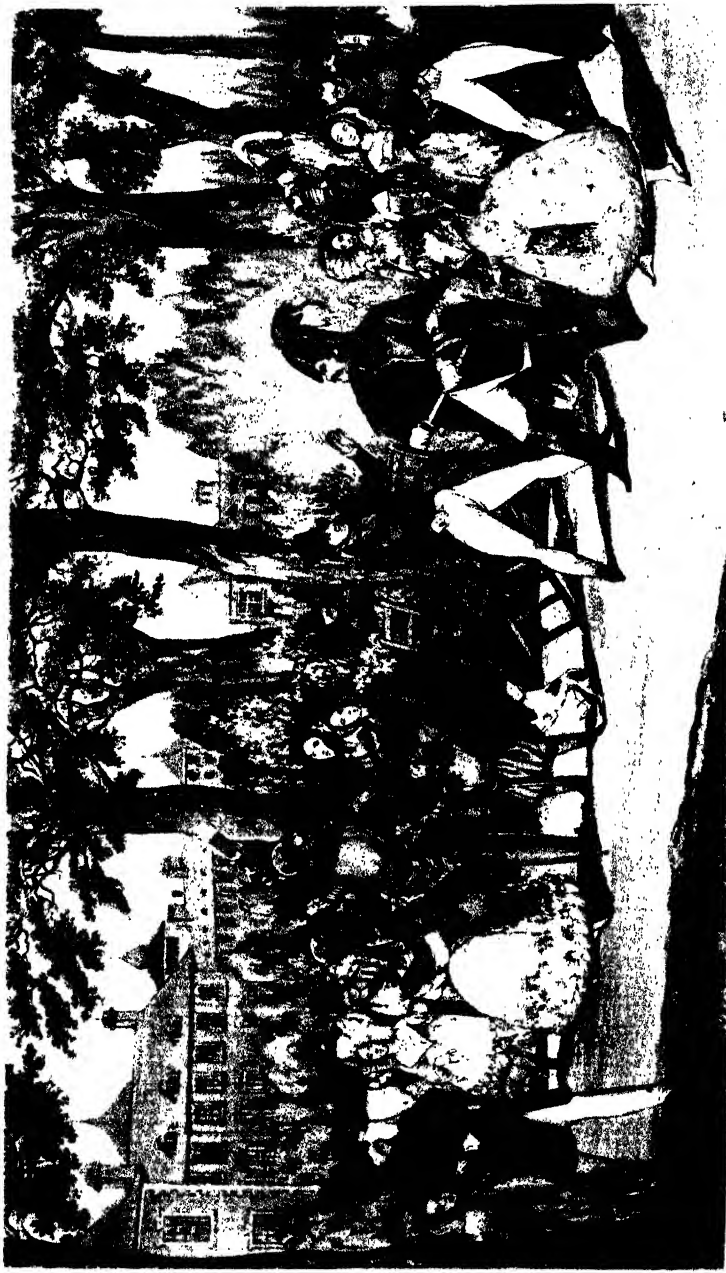
M r . JORROCKS RENOUNCES THE ACQUAINTANCE OF THE YORKSHIREMAN.