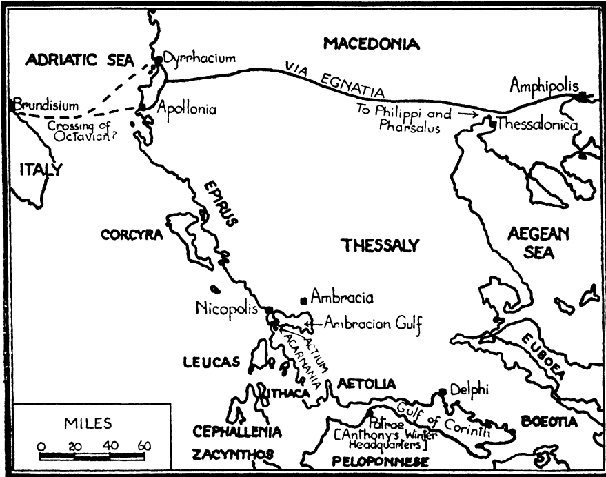
Fig. 2. The Campaign of Actium

previous history, and the Parthian campaign in particular, had shown that Anthony was better in the ordering and conduct of a battle than in the planning of a campaign; he was a good tactician, but an inferior strategist. Then there was the necessity for using the great fleet, but possibly the compelling influence was the opinion of Cleopatra, and the fact that the base of operations was Egypt.