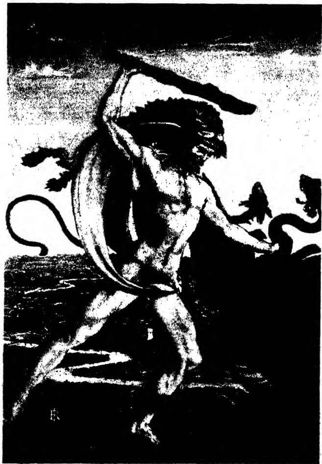
ANTONIO POLLAIUOLO. HERCULES AND THE HYDRA