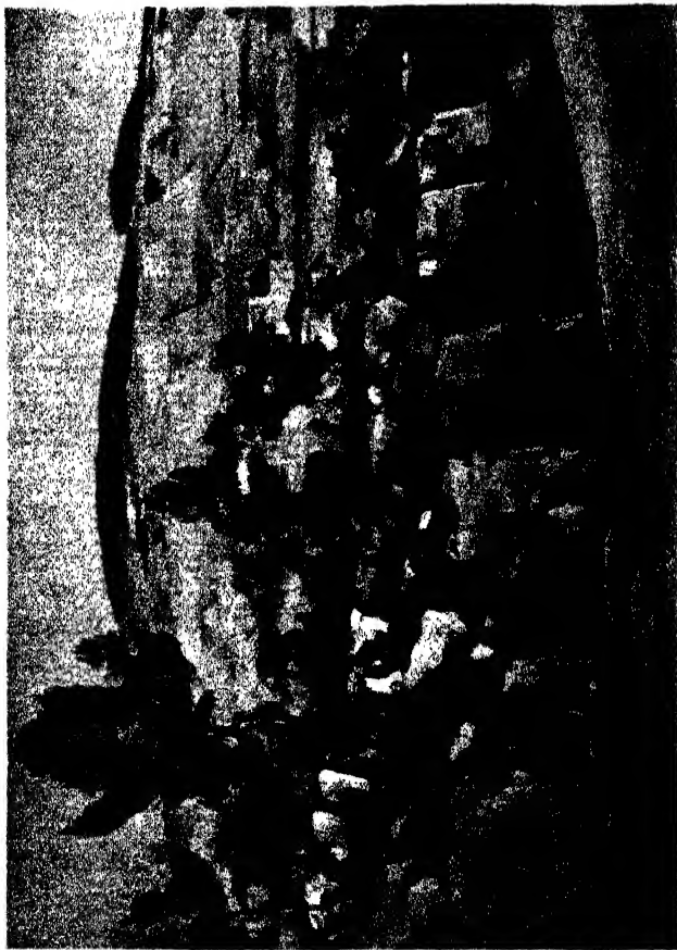
CÉZANNE. LANDSCAPE AT AIX