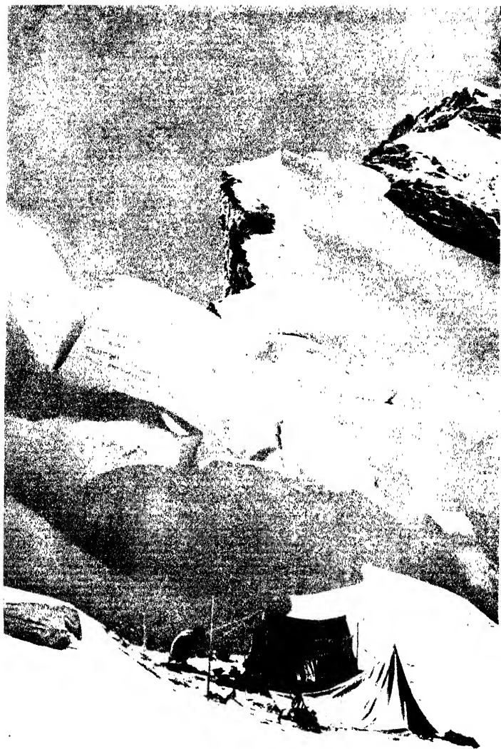
A CAMP ON THE SLOPES OF MOUNT EVEREST