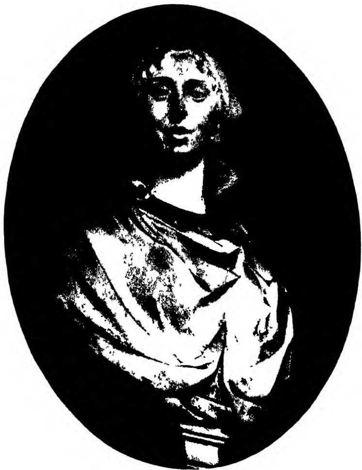
ELIZABETH, WIFE OF SAMUEL PEPYS