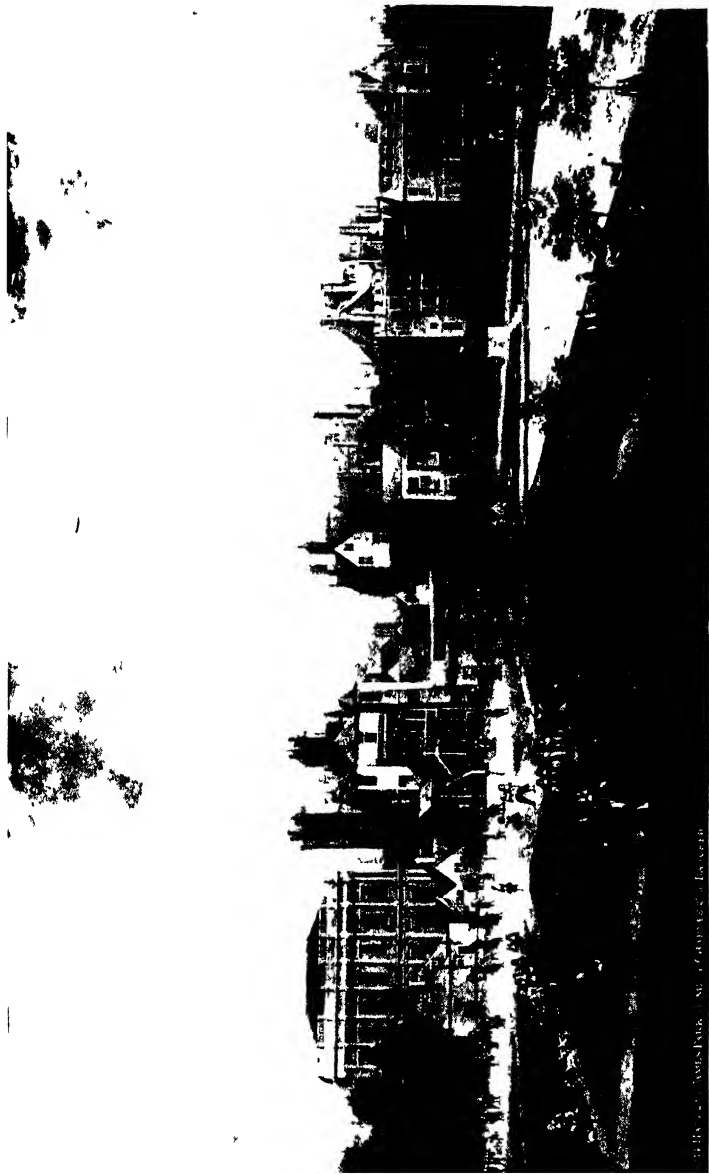
WHILLHALL FROM ST. JAMES'S PARK

ST. JAMES'S PARK, N.W. 1/4, 1880. L. 10. 10. 10.