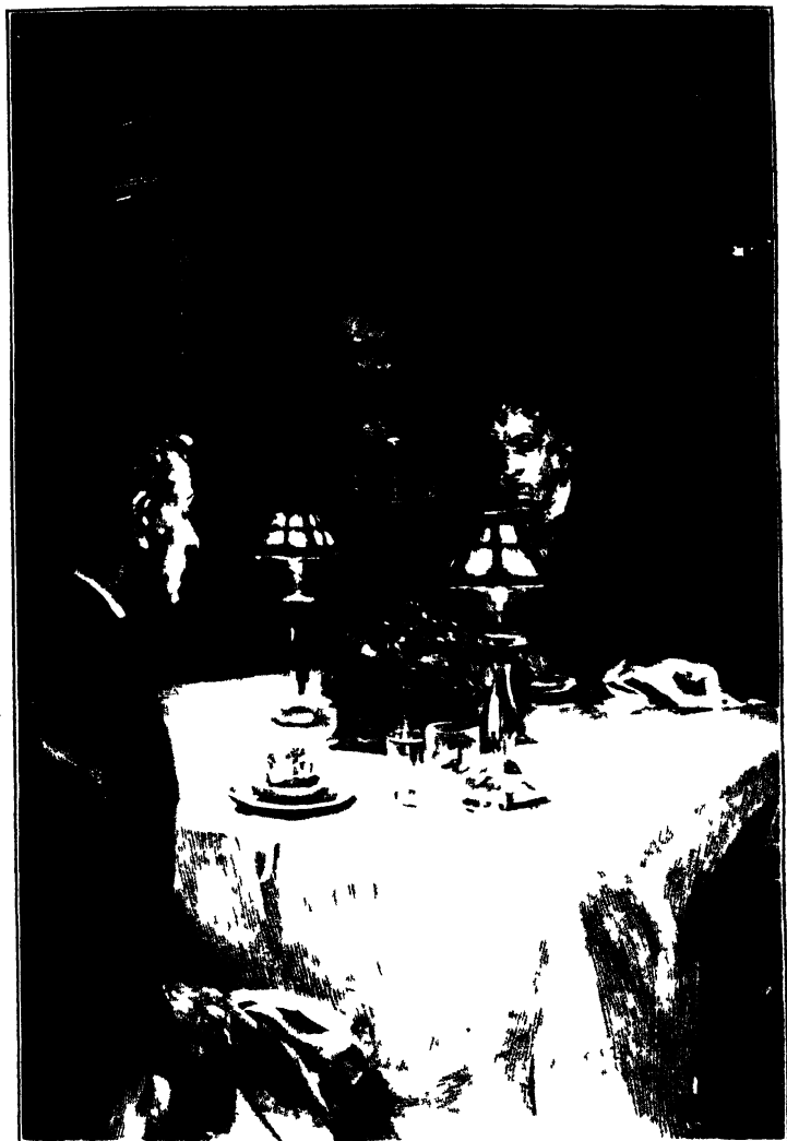
"THE TWO SAU GAZING AT EACH OTHER AS FROM MOUNTAIN PEAKS ACROSS THE ASSABLE VALLEYS."