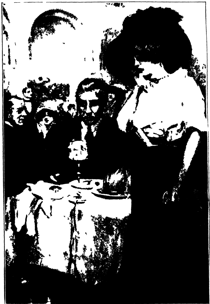
LEUSS LAIS E HUNGLY ATE ALL