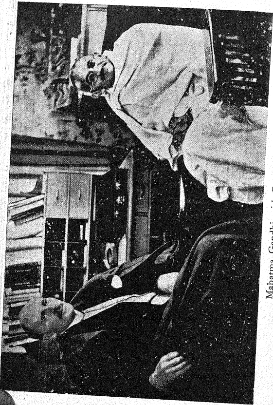
Mahatma Gandhi with Romain Rolland